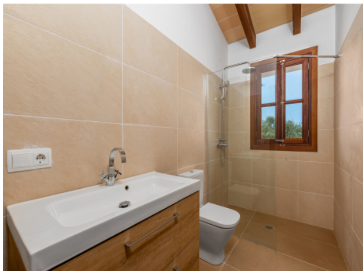
One of 4 bathrooms