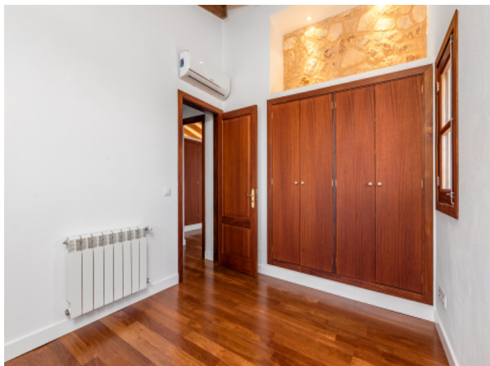
One of 5 bedrooms