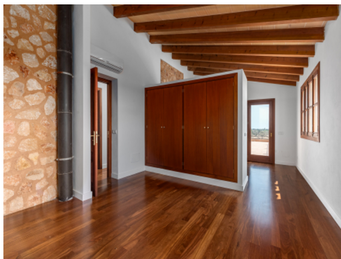
One of 5 bedrooms