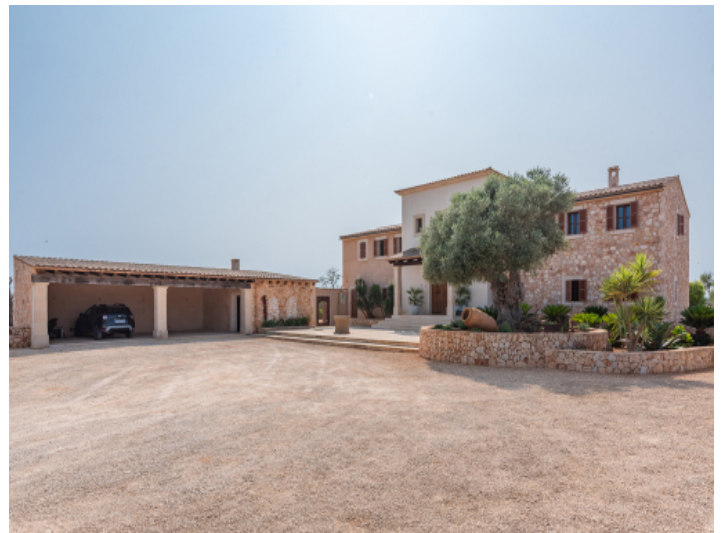
Spacious drive way of the finca