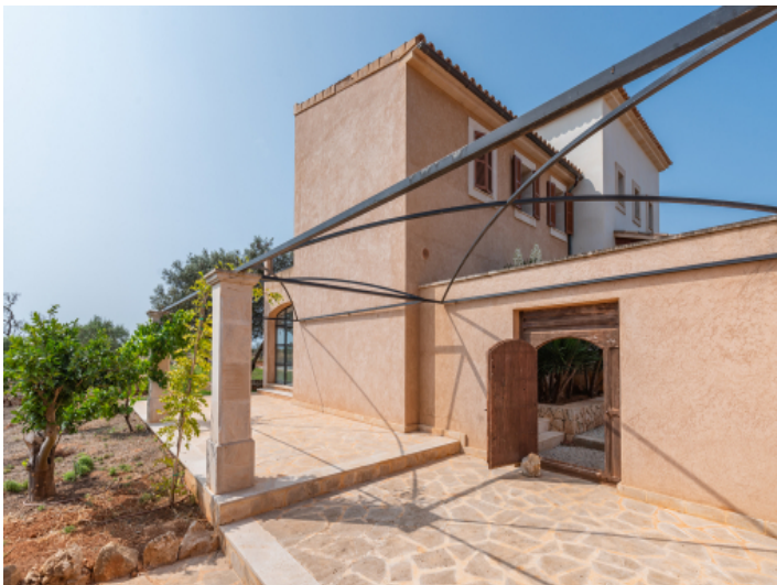
Exterior view of the finca