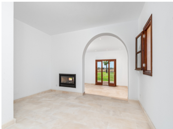
Living and dining area with fireplace