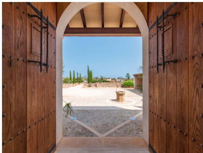
Impressive entrance door