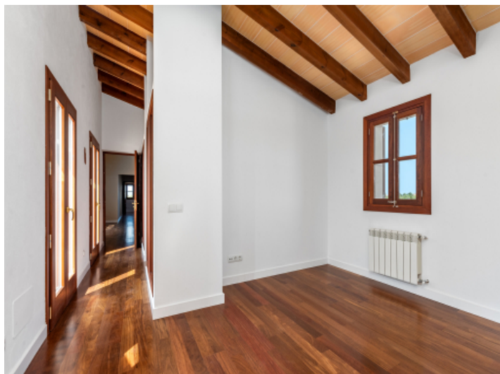
One of 5 bedrooms