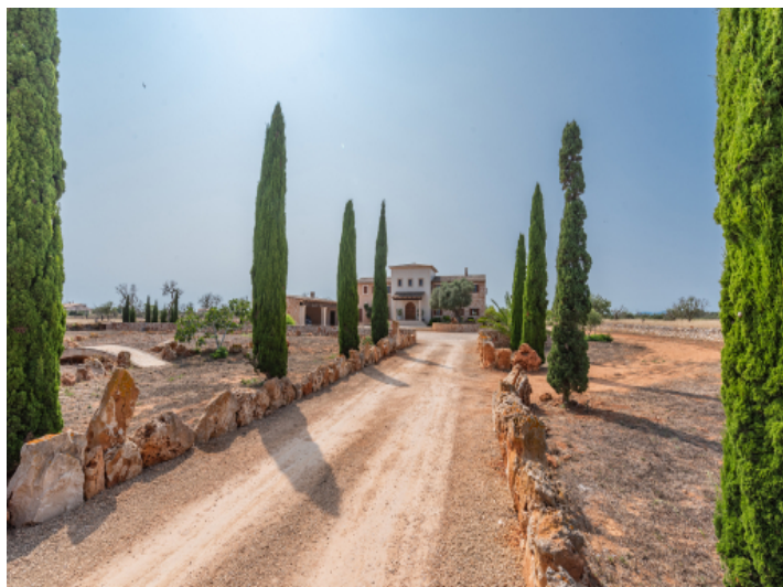
Drive way of the finca