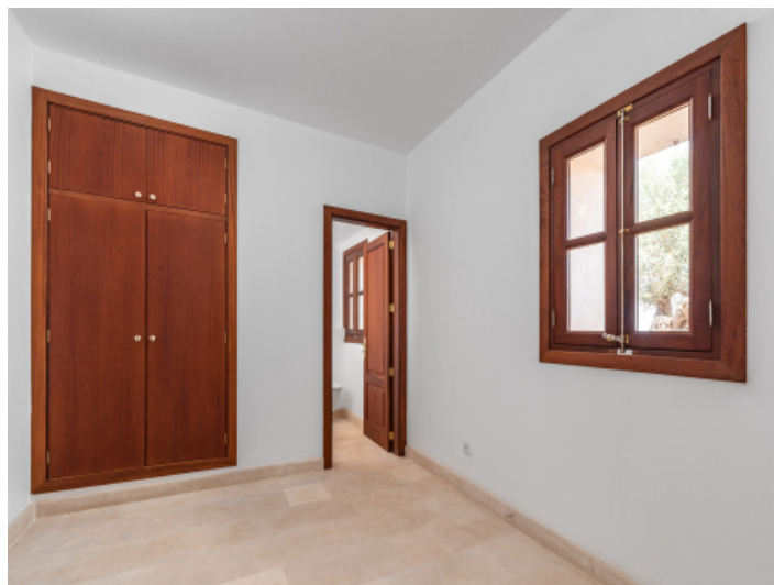
One of 5 bedrooms