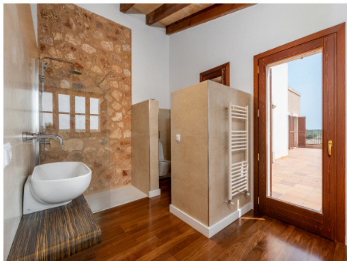
One of 4 bathrooms