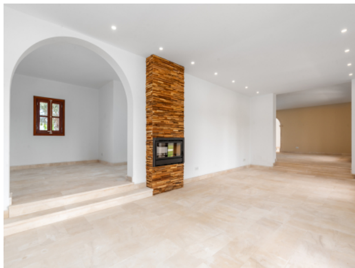
Living and dining area with fireplace