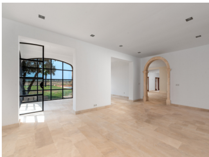
Living and dining area