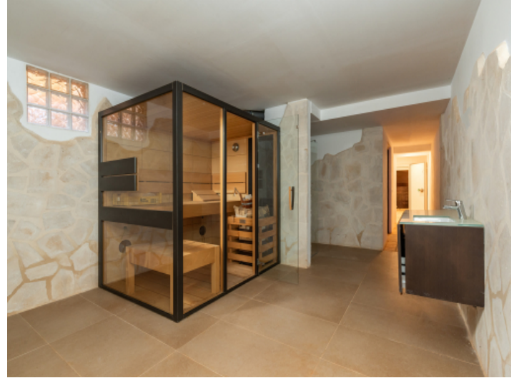
Spa area and sauna