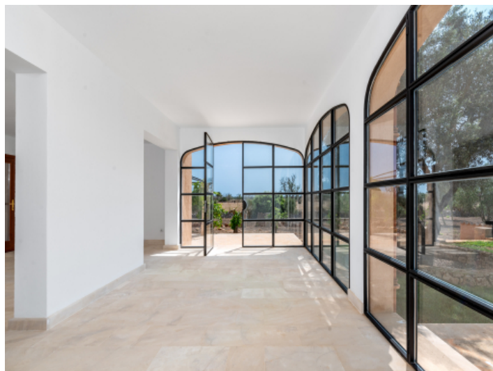
Living and dining area