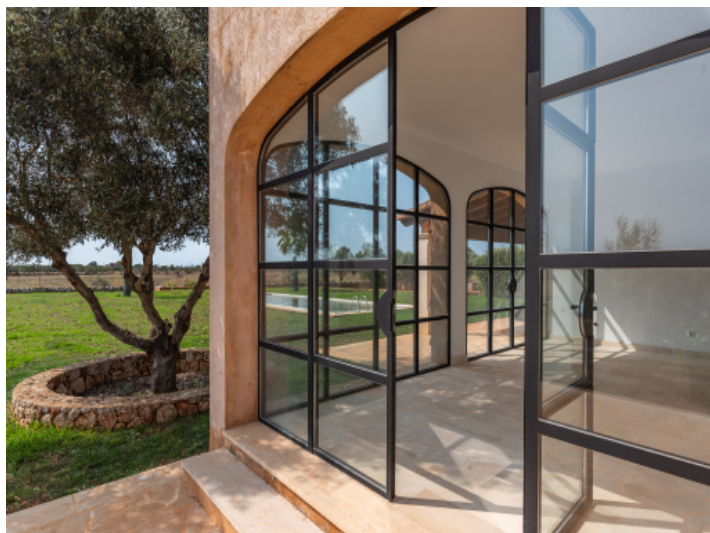
Living area with access to the pool