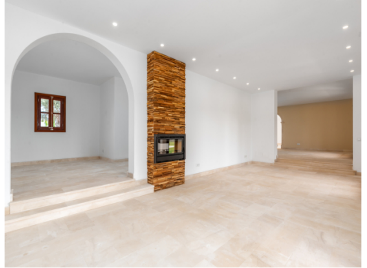
Living and dining area with fireplace