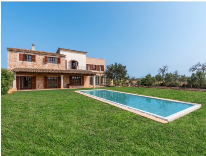
Garden and pool area