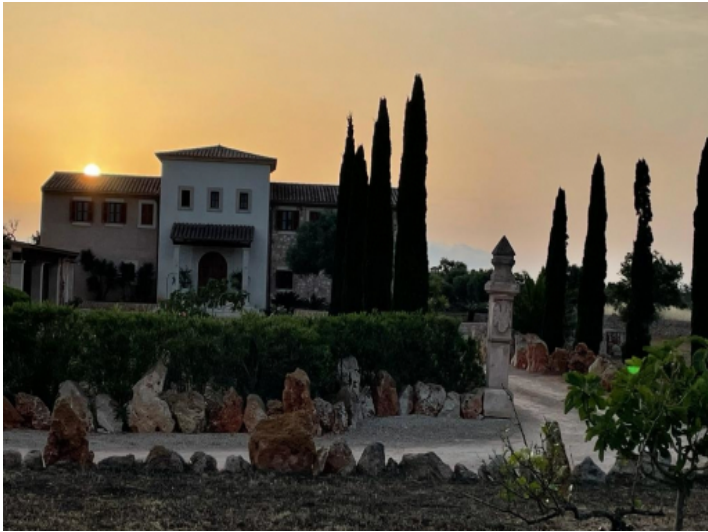
Finca at night