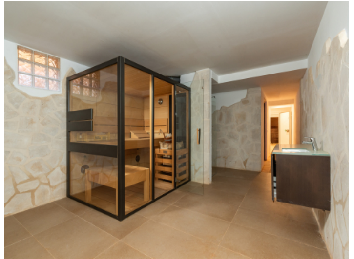
Spa area and sauna