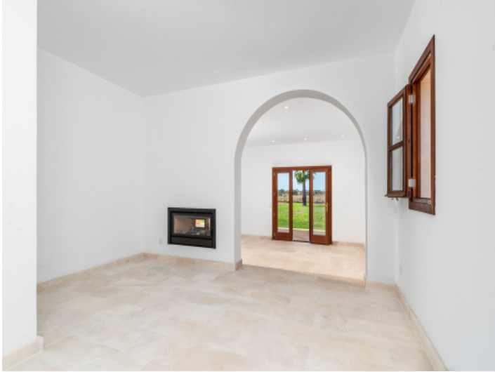
Living and dining area with fireplace