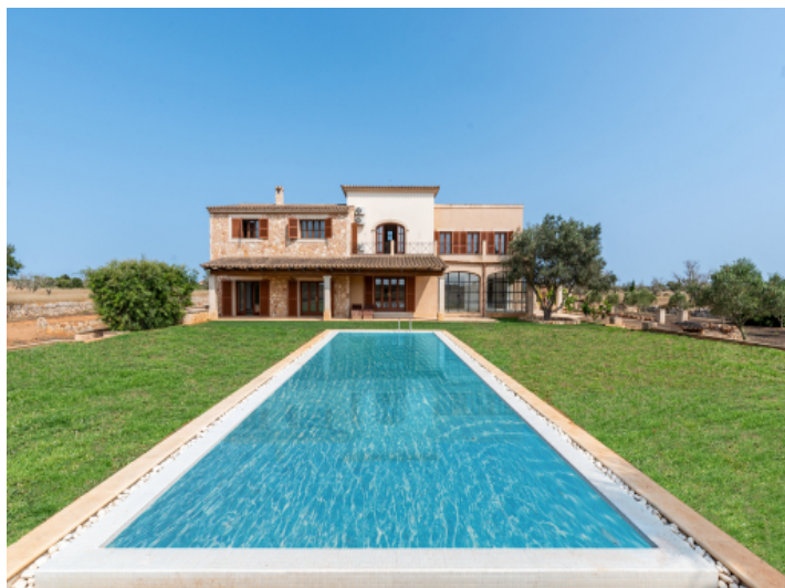
Garden and pool area