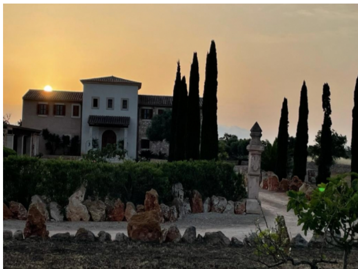
Finca at night