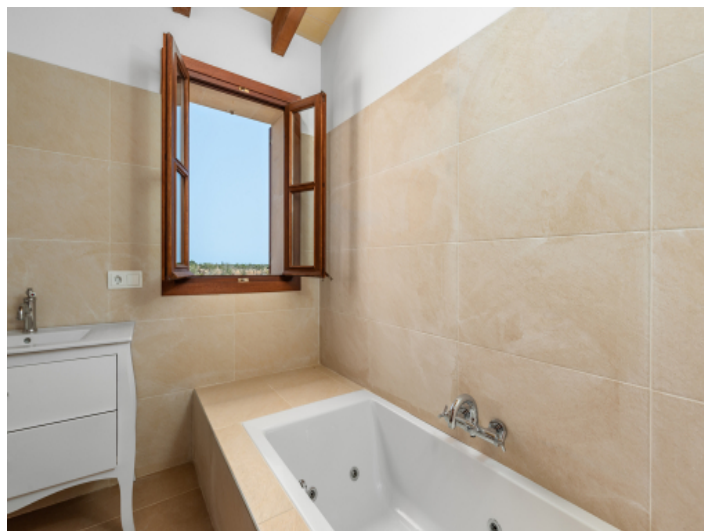
One of 4 bathrooms