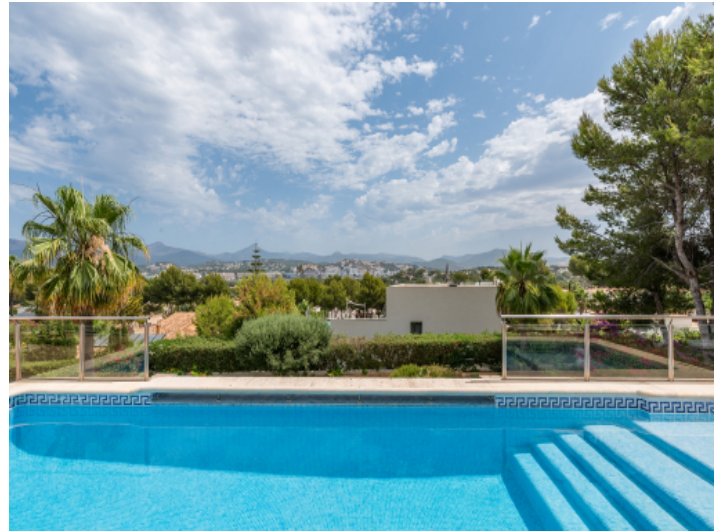
Pool with a view