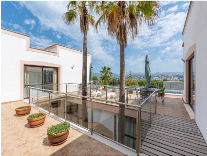
Terrace and patio