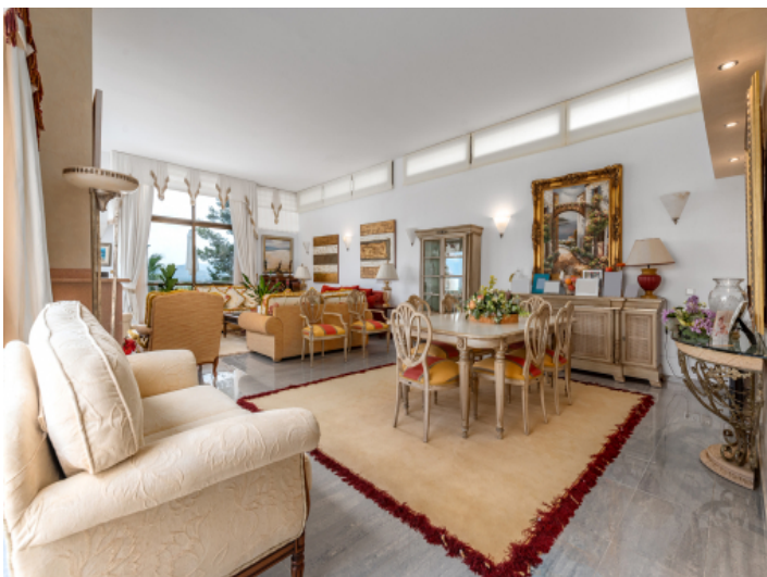
Mail living area