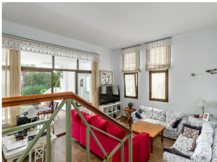
Lower living area