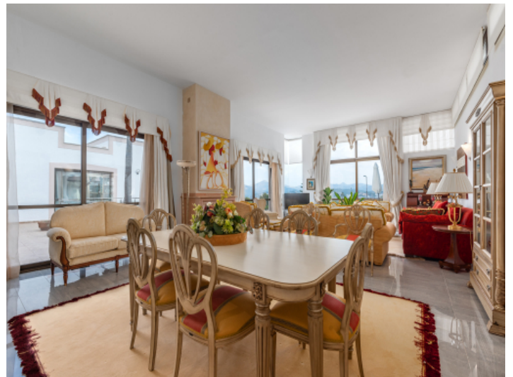
Mail living area