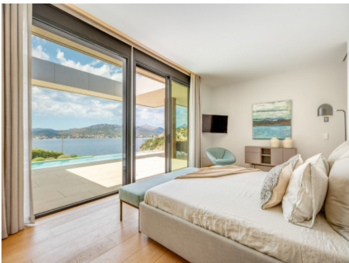
Bedroom with sea view terrace