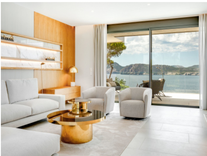
Modern living area