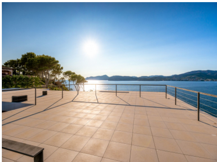
Large sea view roof terrace