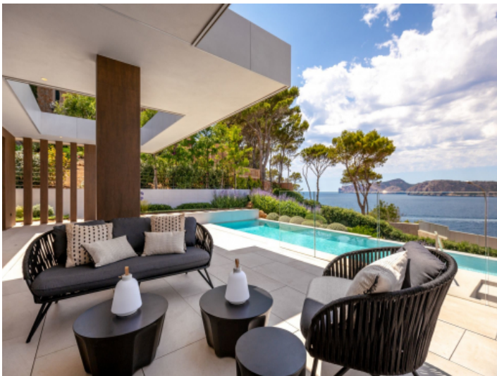
Sea view lounge terrace