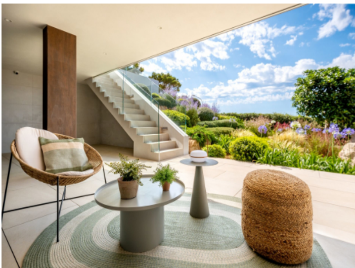
Tranquil lounge terrace