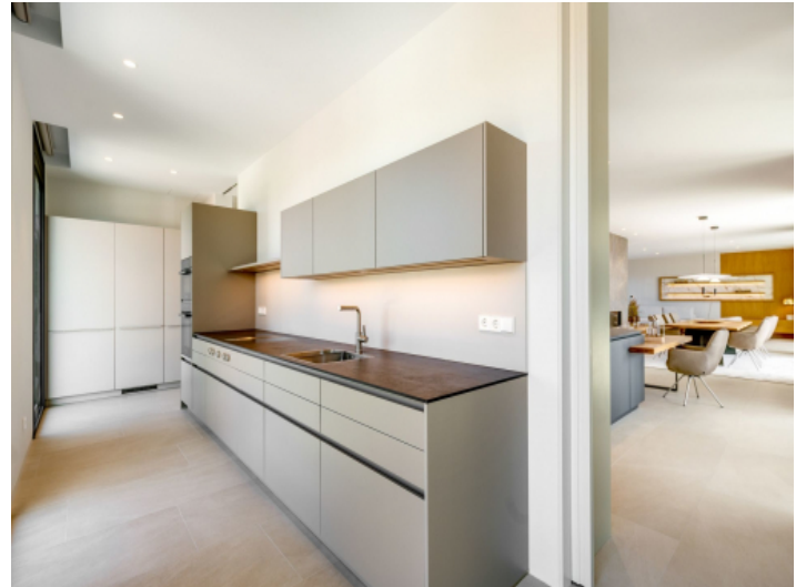
Further hidden kitchen