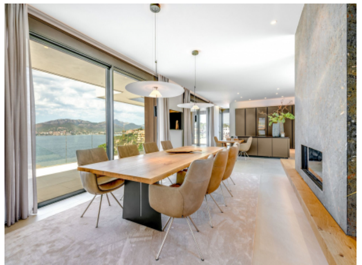
Stylish dining area