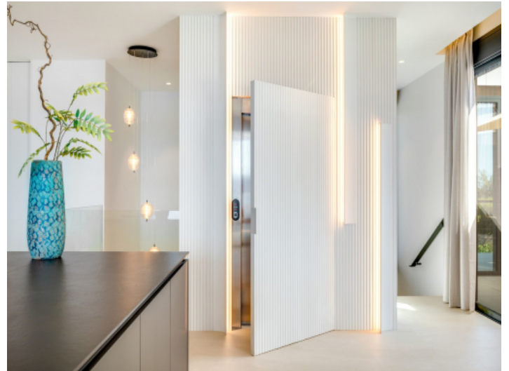
A lift connects the floors