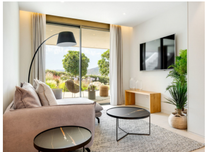
Further living area in the lower floor