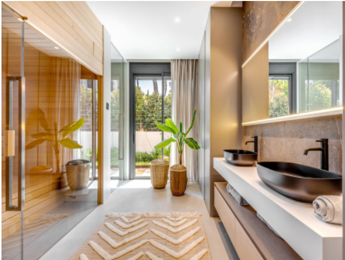
Luxury bathroom with sauna