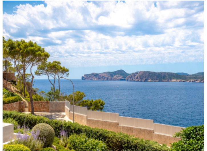
Wonderful sea views