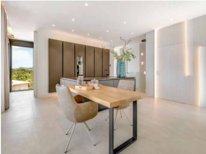
High-quality designer kitchen