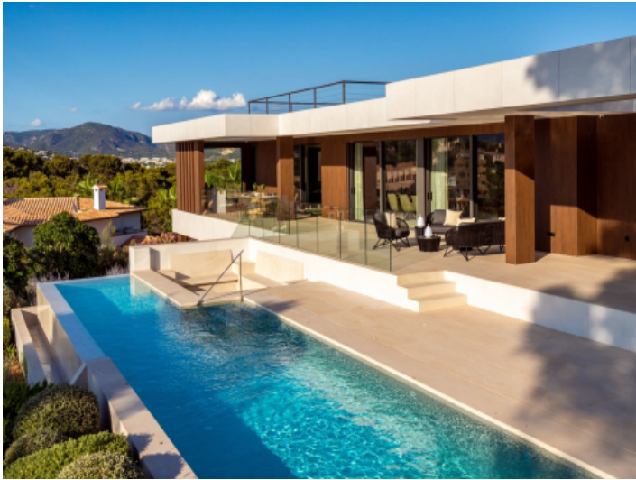
Elegant pool with sun terraces