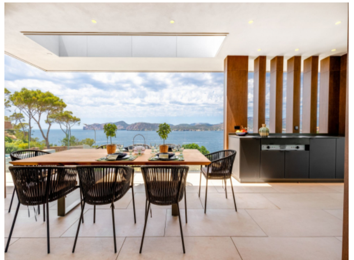
Outdoor sea view terrace