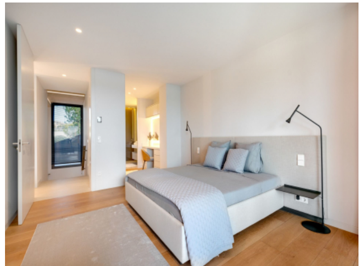
Open en suite bathroom