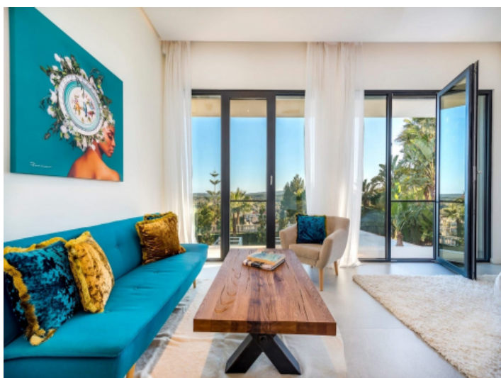
Separate sitting area