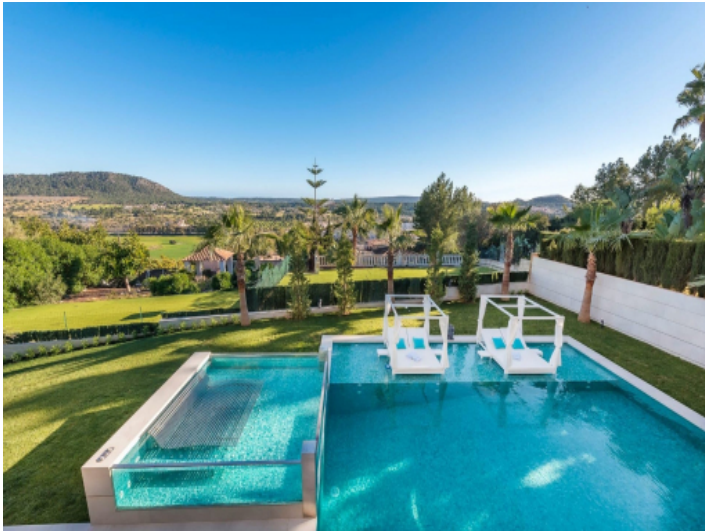
View of the villa