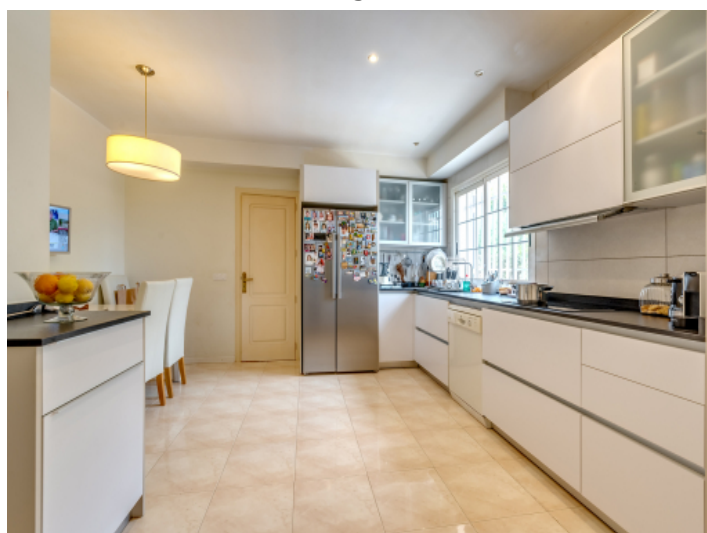
Kitchen with dining area