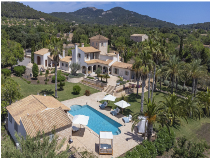
Exterior view of the finca property