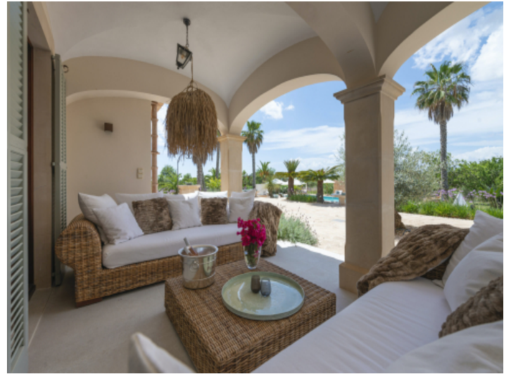
Terrace with sitting area