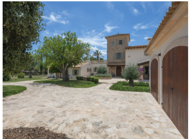
Exterior view of the finca property