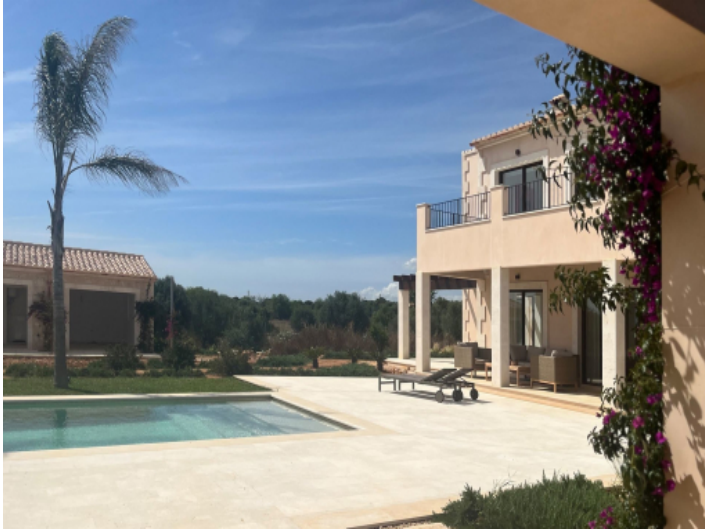
Finca and pool