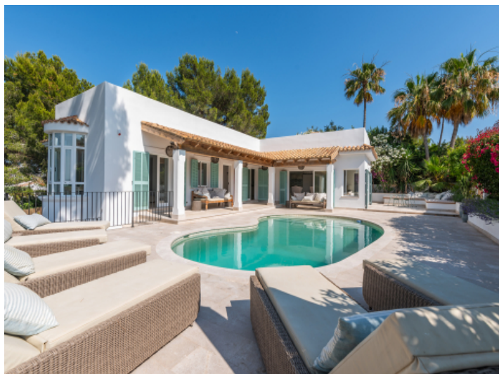
Sun loungers by the pool