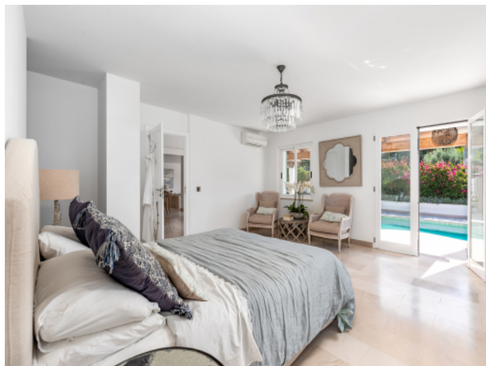
Bedroom with pool access