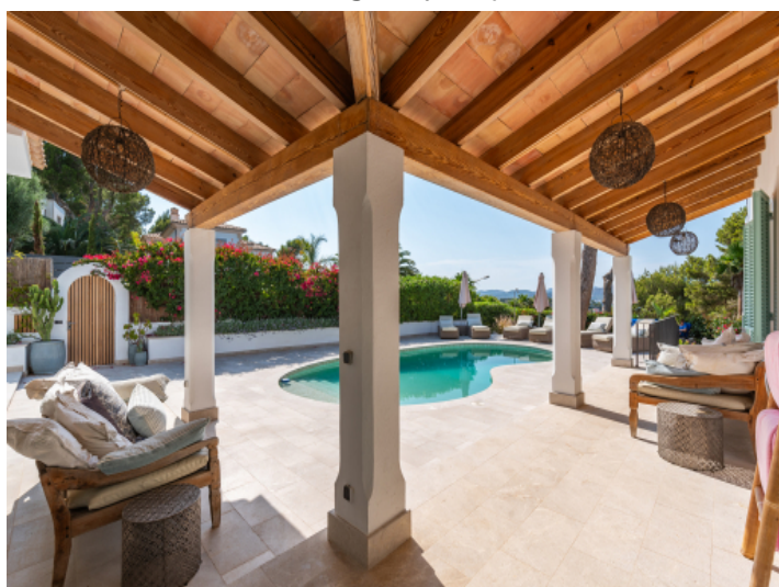
Covered terrace by the pool