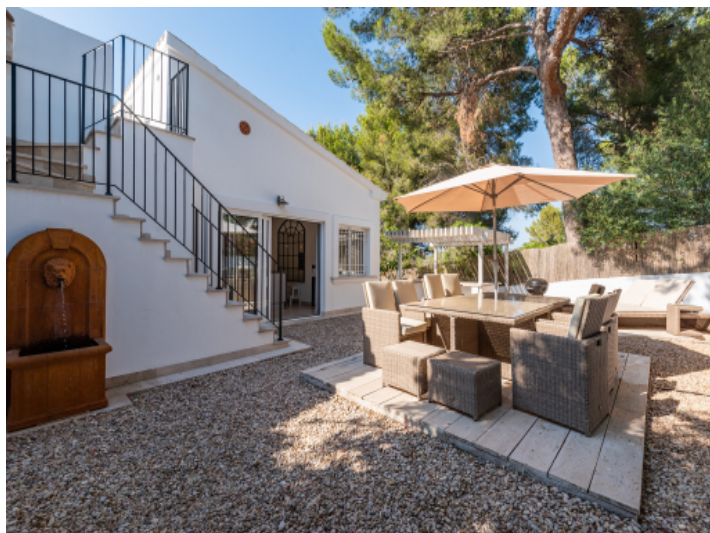
Separate bbq area