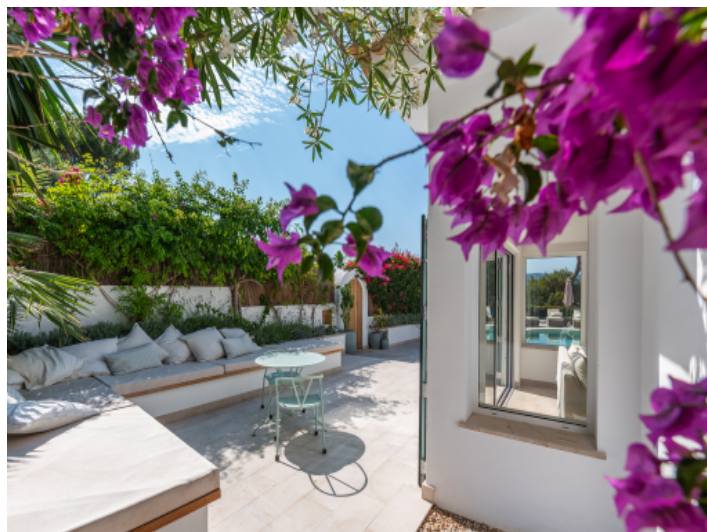
Inviting chill out area