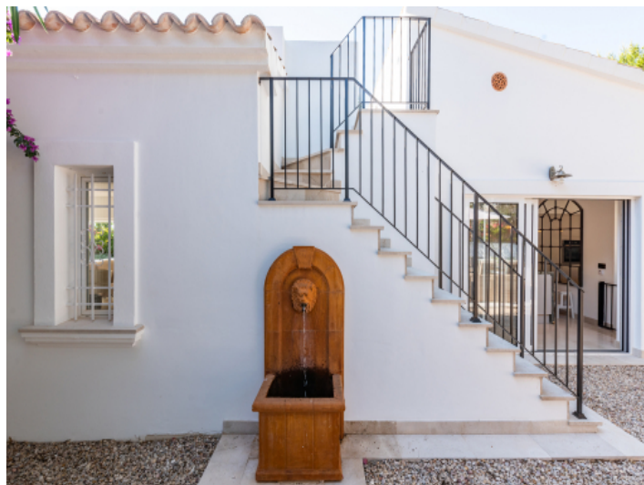
Access to the upper terrace