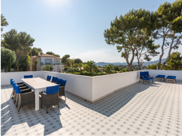
Dining area on the roof terrace