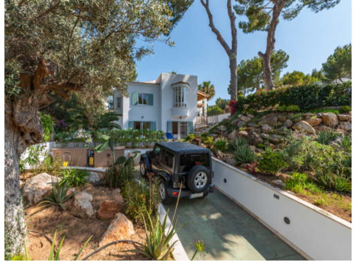
Exterior view and drive way