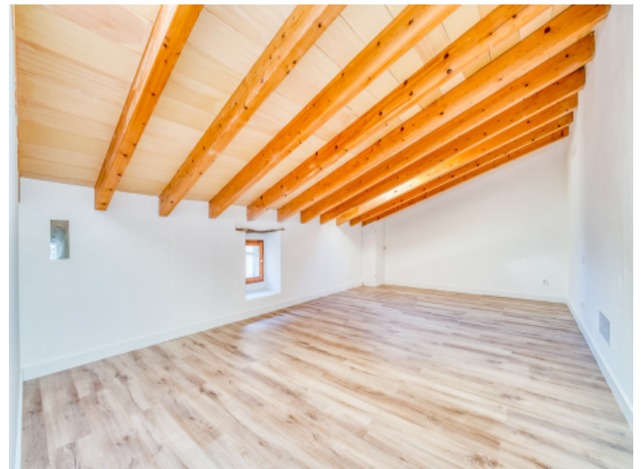
Light flooded bedroom