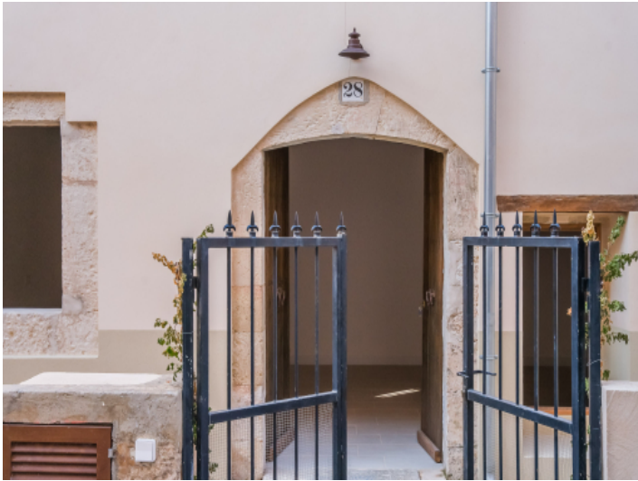
Entrance to the house