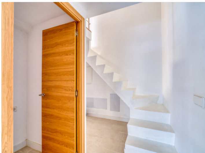
Staircase leads to the upper floor