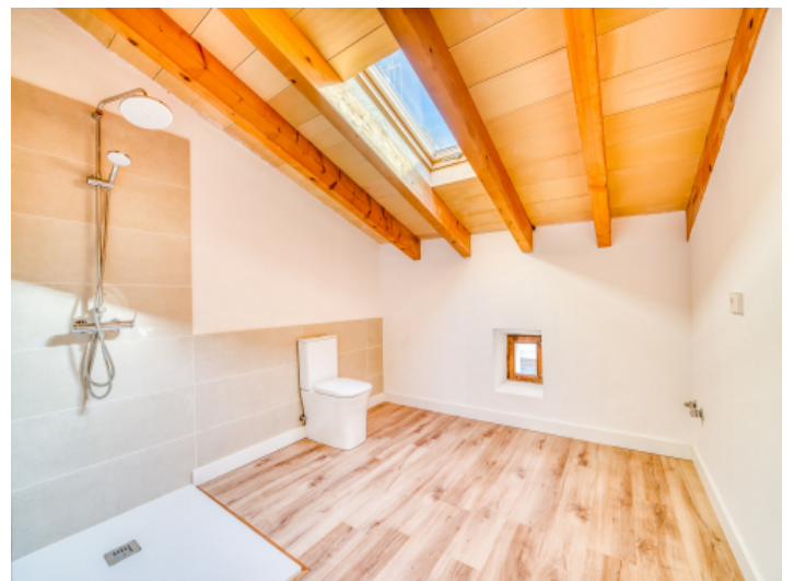
Bathroom with daylight and shower