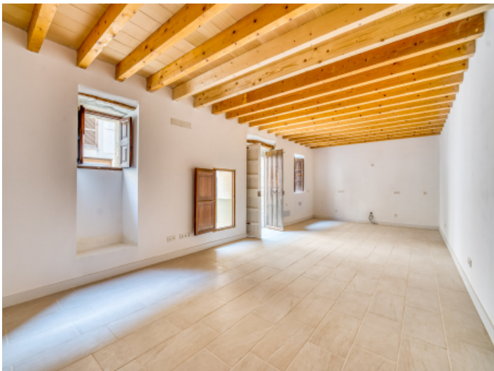
Modern living area