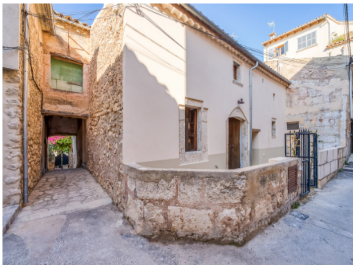
Views from the street to the townhouse