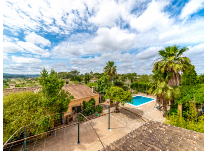
Lovely views over the surroundings