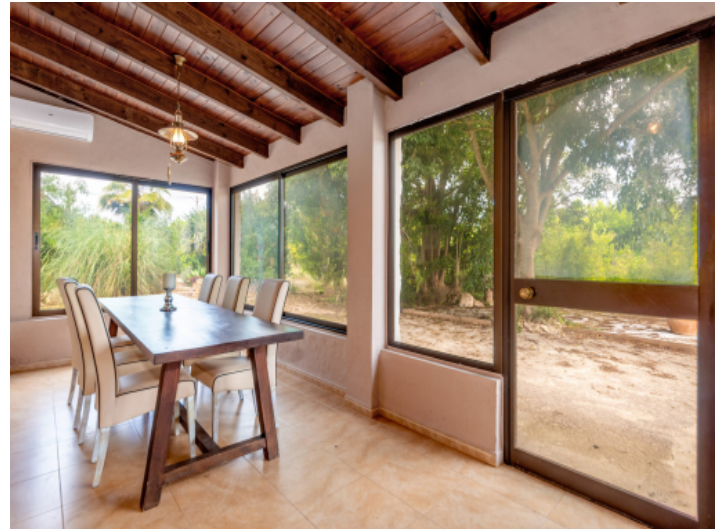
Wintergarden-like dining area