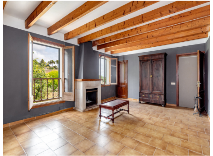
Further room with fireplace