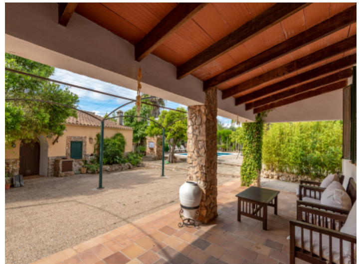
Covered terrace with seating area