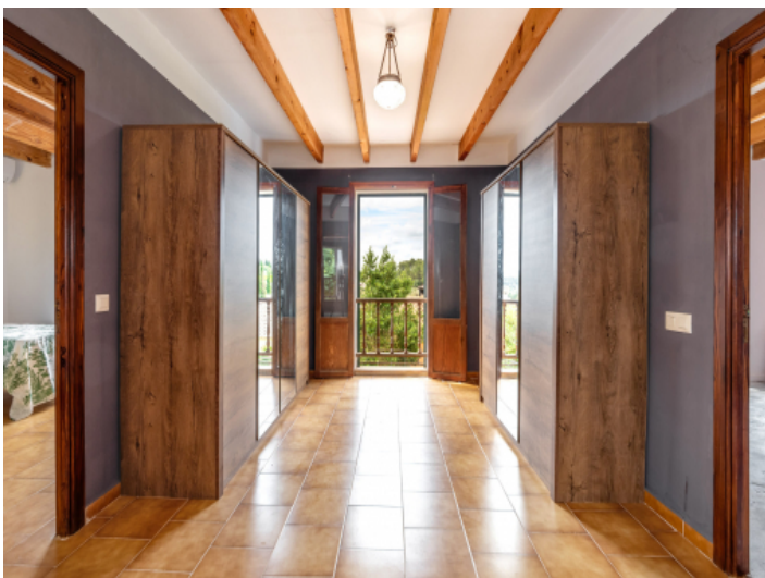
Large dressing room