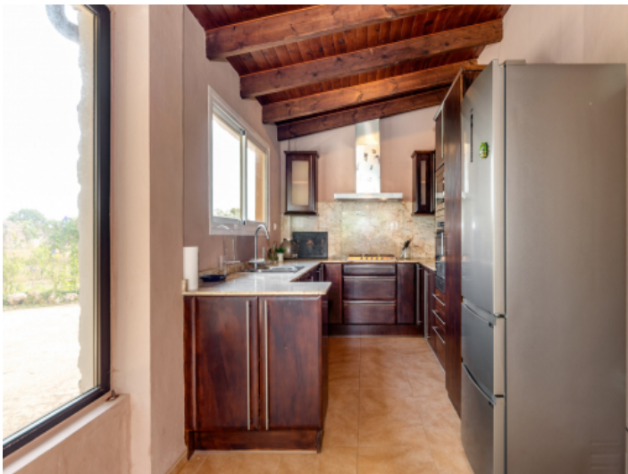
Wooden country house kitchen