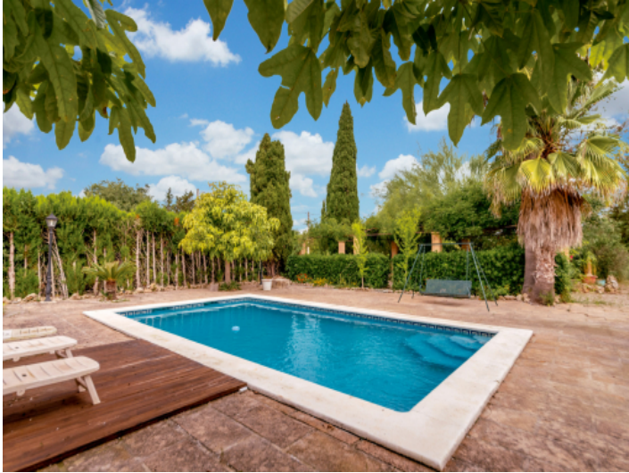
Idyllic pool area