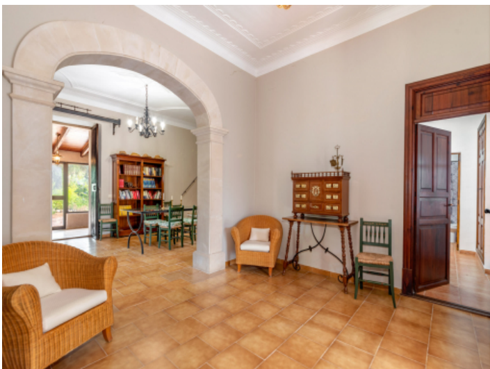
Hall with stone arch