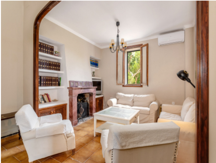
Living area with fireplaxe