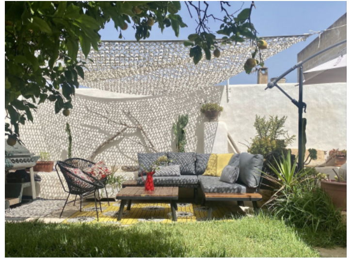
Idyllic lounge area in the garden