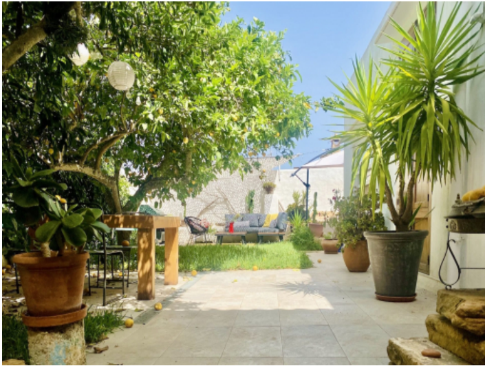
Beautifully planted garden