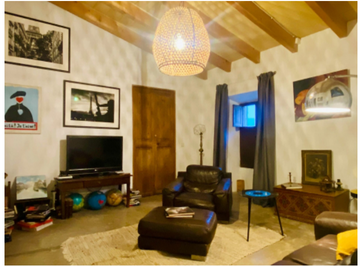
Further living room