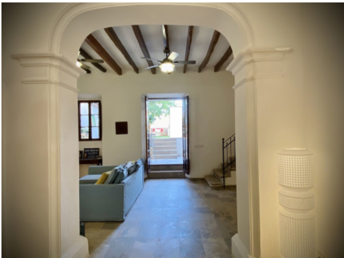
Living area with garden access