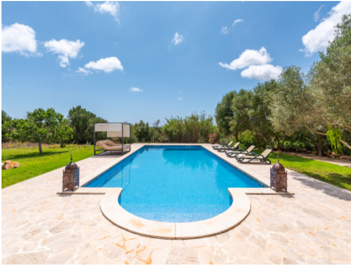
Splendid pool area