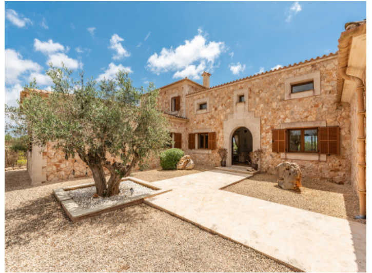
Beautiful finca with pool and garage surrounded by nature in