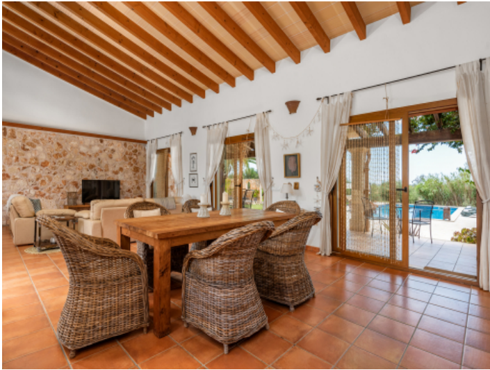
Spacious dining area