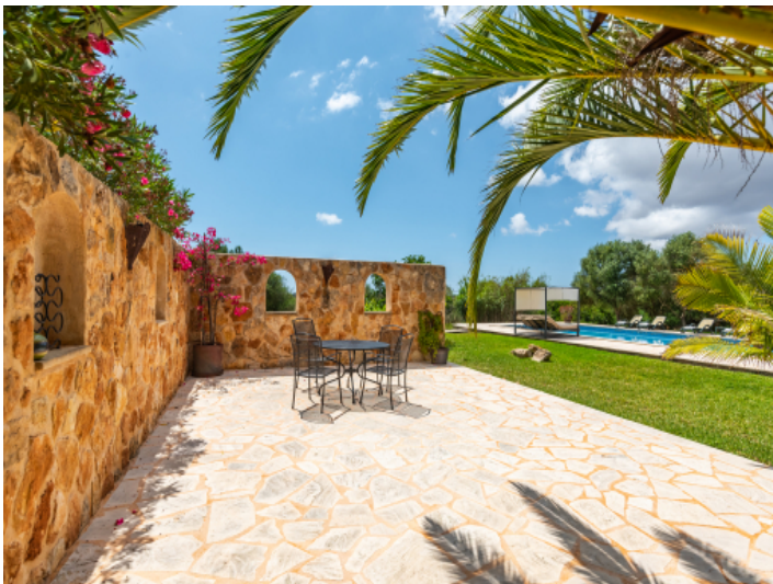
Spacious sunny terrace