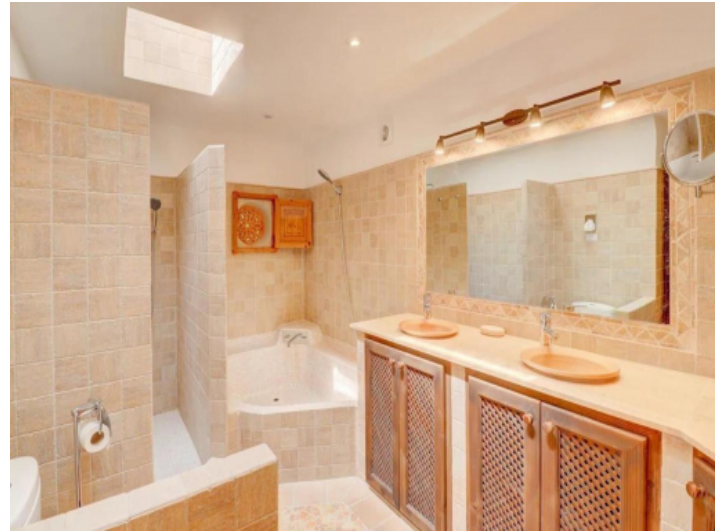
One of 5 bathrooms