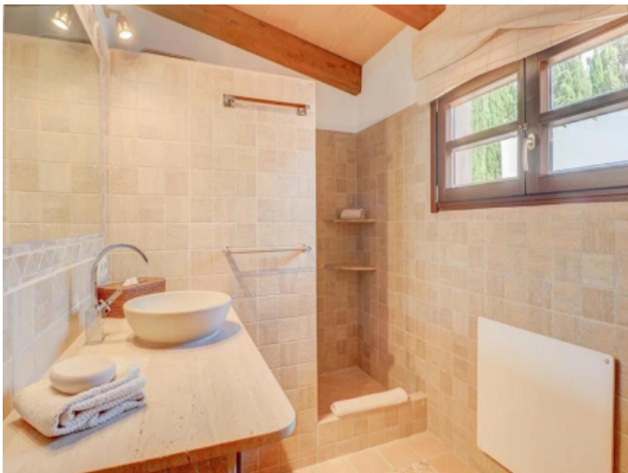
One of 5 bathrooms