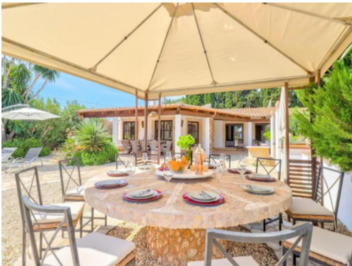
Outdoor dining area