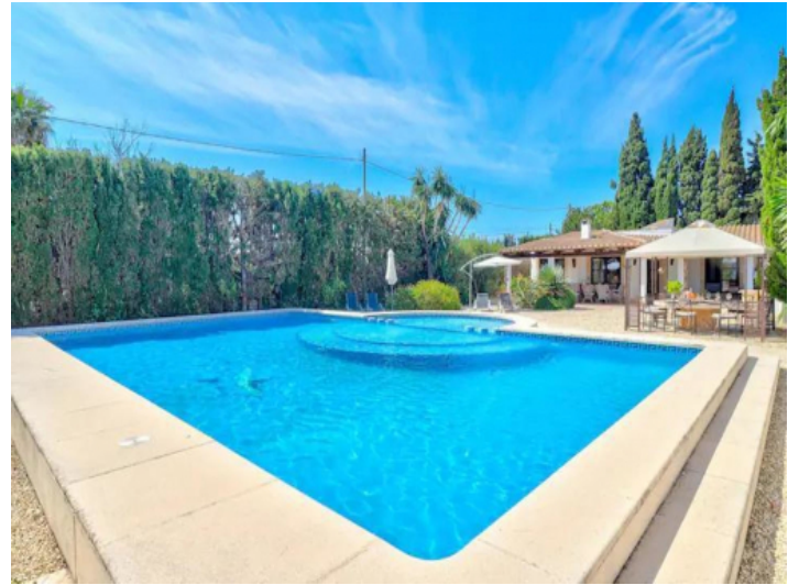
Very large pool