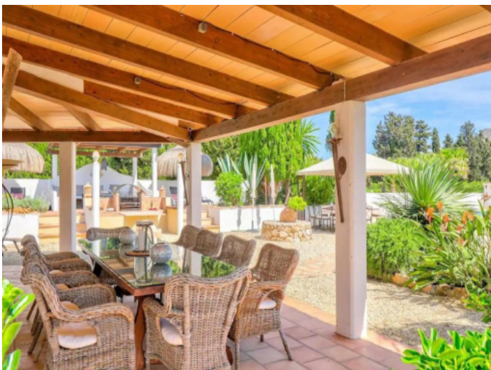
Covered terrace with dining area