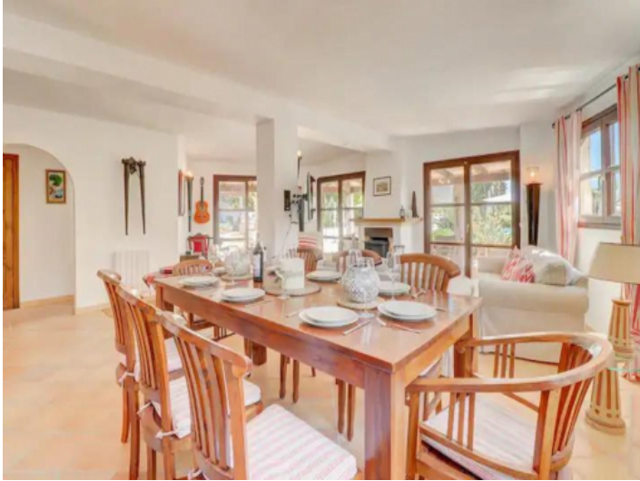
Bright dining area