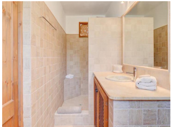
One of 5 bathrooms