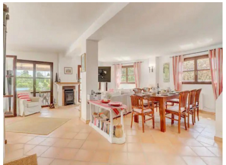
Spacious living and dining area with fireplace