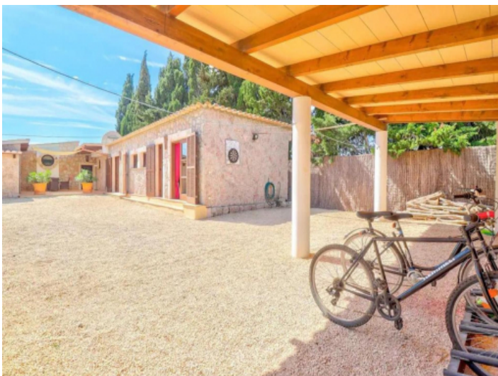
Separate guest apartments