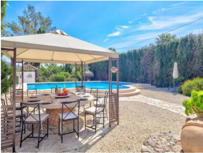
Lovely pool area