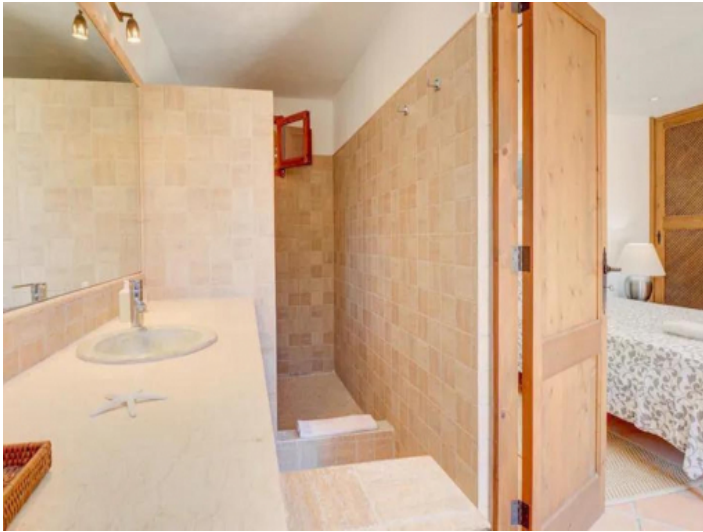
One of 5 bathrooms