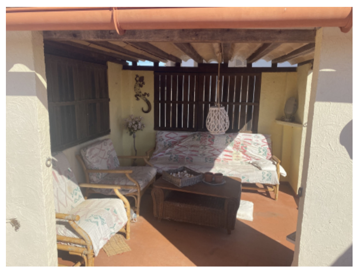
Covered chill out area