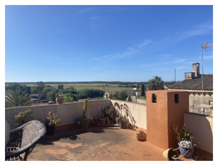
Sunny roof terrace