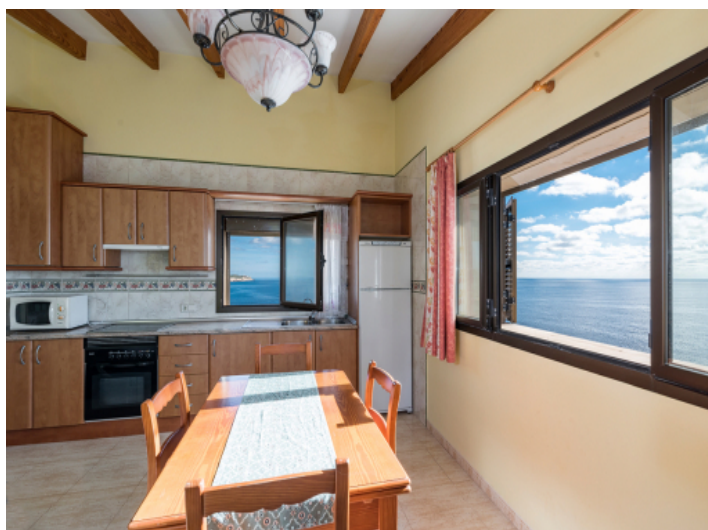
Dining area and kitchen with panoramic views