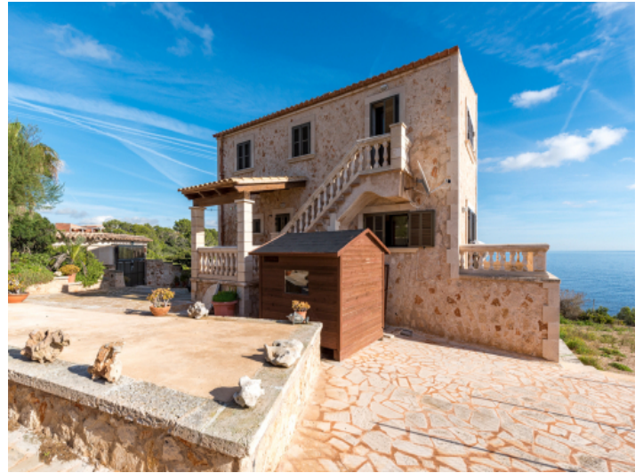
Front view of the villa with stone facade