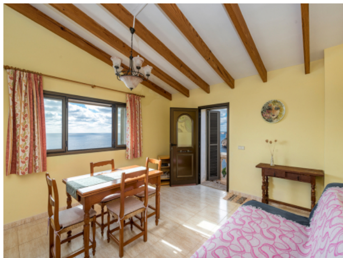
Further dining area with wooden ceiling beams