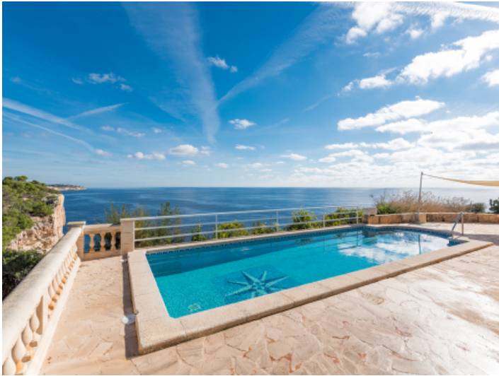
Gorgeous pool area next to the sea