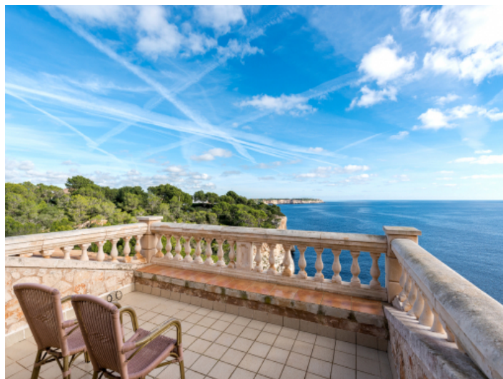
Magnificent roof terrace with sea views