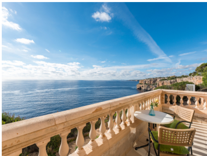
Stunning sea view terrace