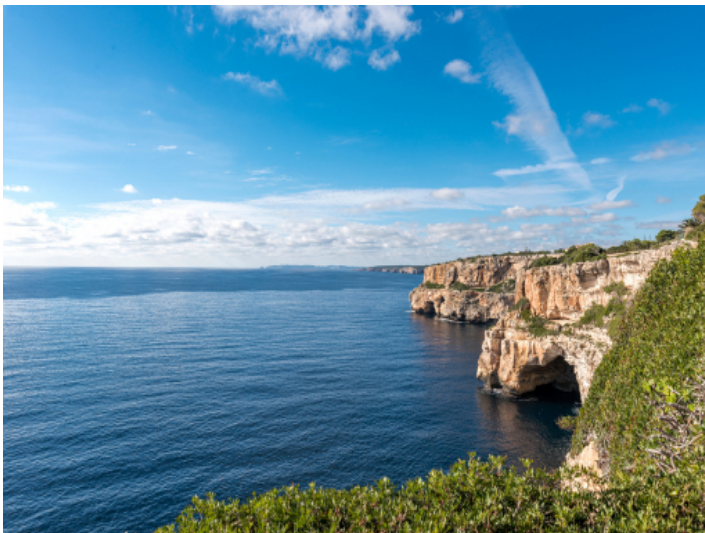
View of the sea and the cliffs