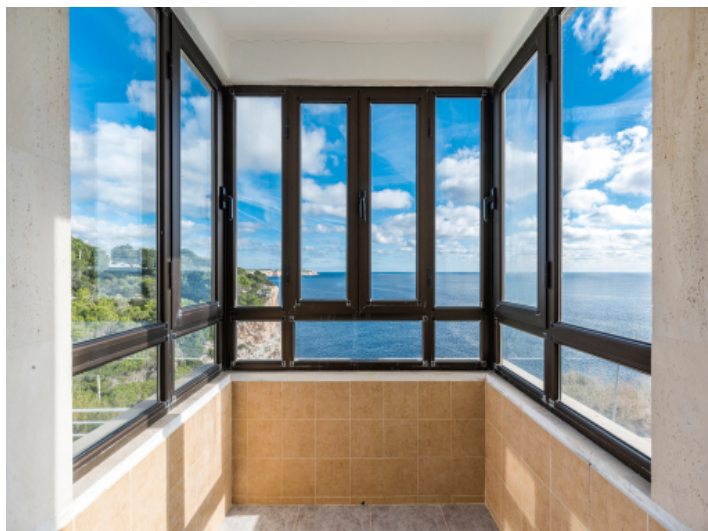
Beautiful panoramic views