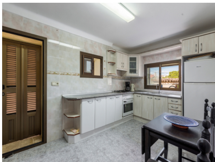
Second kitchen of the property