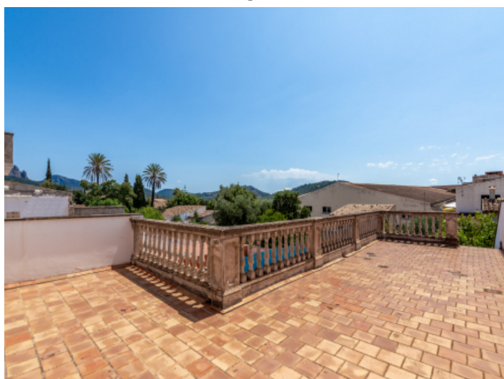
Large roof top terrace