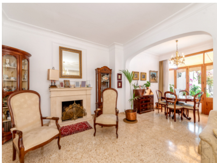
Living and dining area