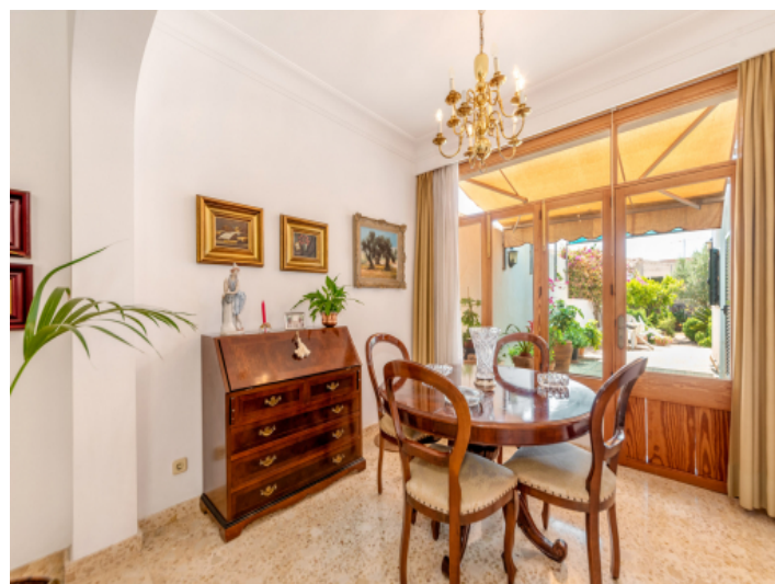
Dining area with access to the terrace