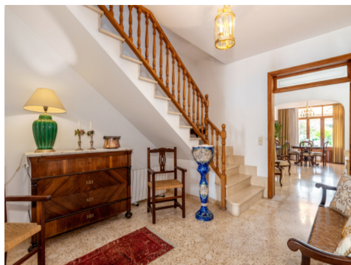
Floor and sitting area