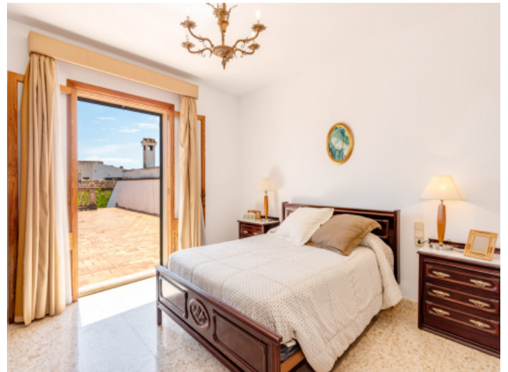
Bedroom with terrace