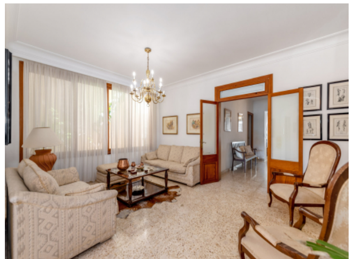
Separate living area