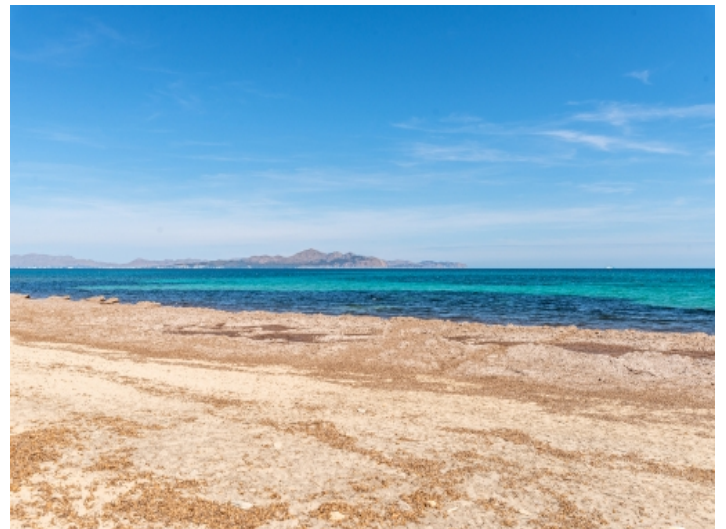
Walking distance to the beach