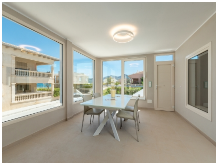
Dining area with panoramic views