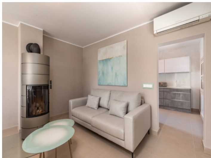
Living area adjacent to the kitchen