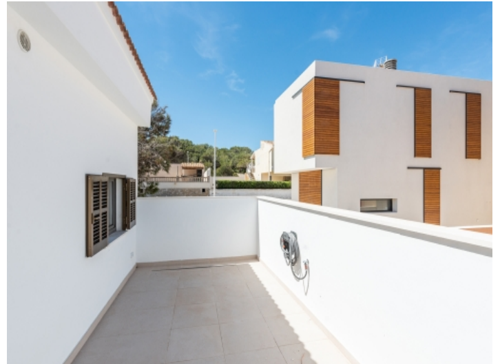
Spacious sunny terrace