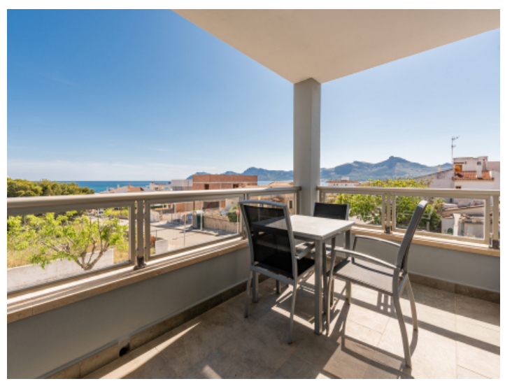
Covered terrace with sea and mountain views