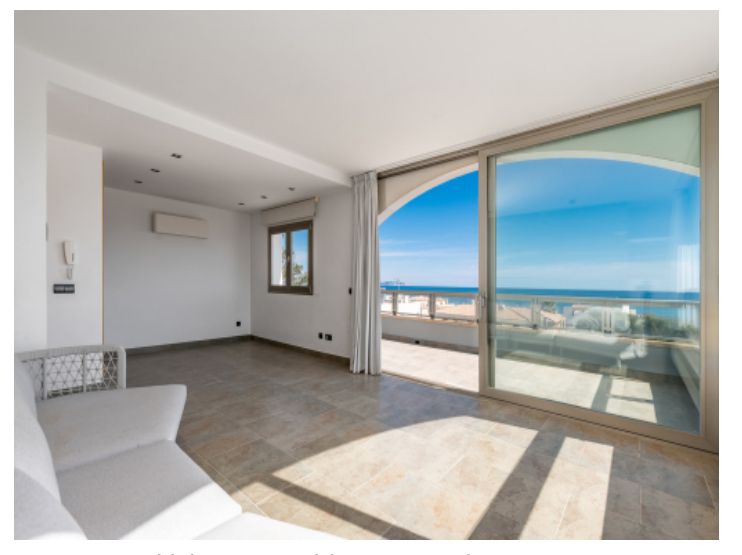
Living room with access to the terrace