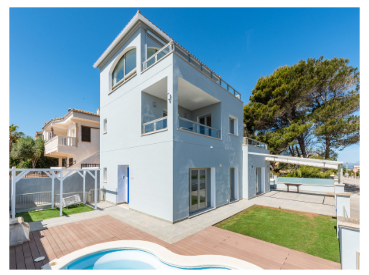
View of the house