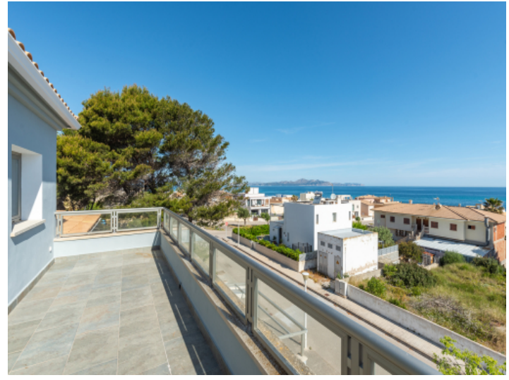
Large uncovered terrace