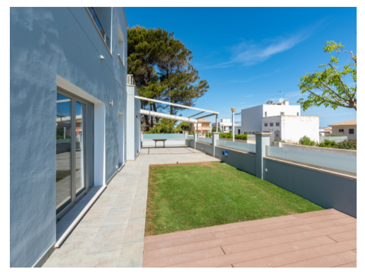
Beautiful outdoor space