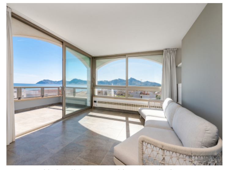
Modern living room with panoramic views