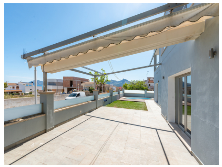
Spacious terrace with awning