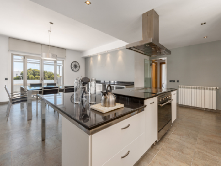
Modern kitchen and dining area