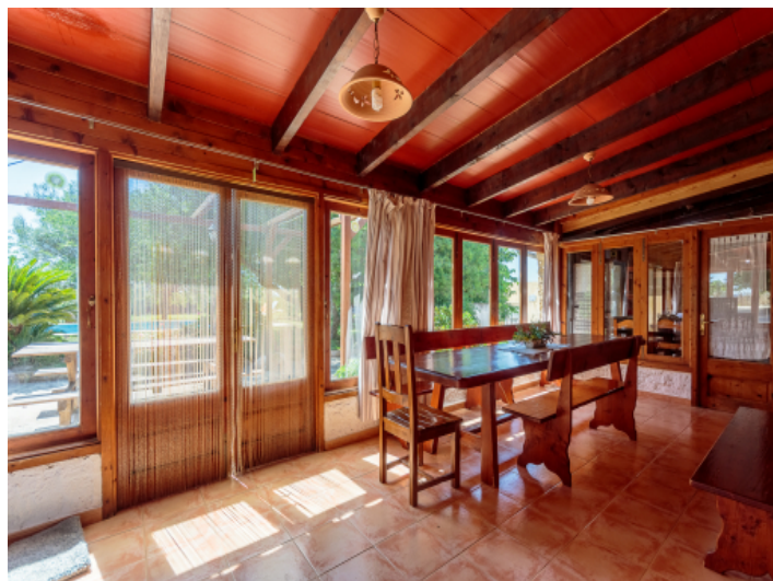
Cozy living and dining area