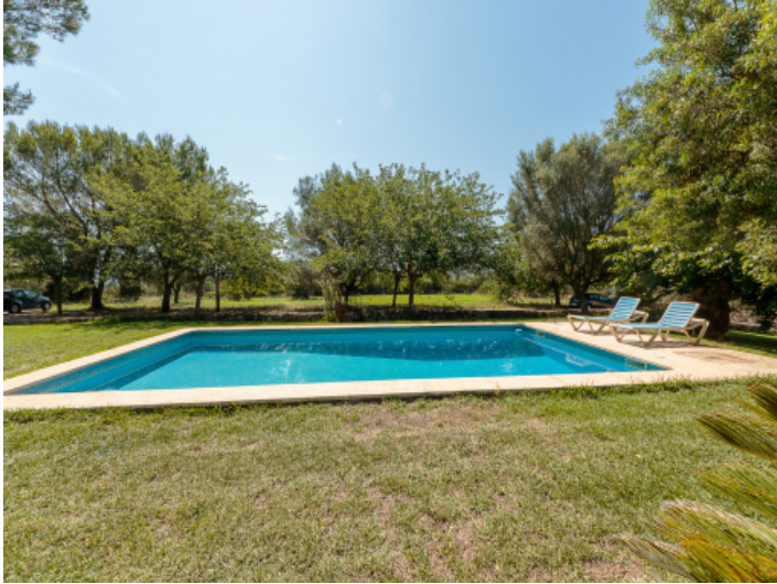
Pool and garden area