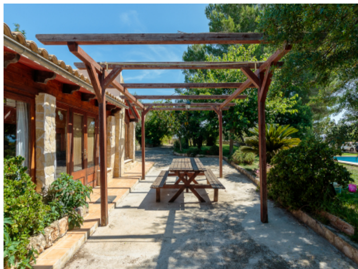
Terrace and dining area