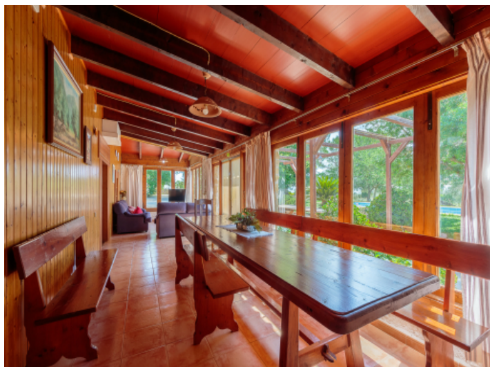
Cozy living and dining area