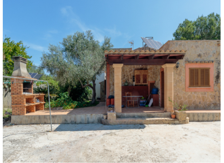
Terrace with barbecue area