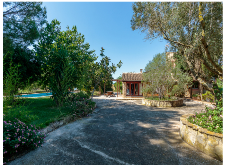
Driveway to the finca