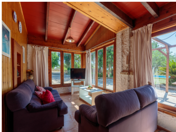
Cozy living and dining area