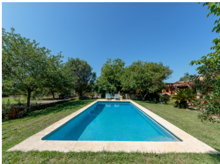
Inviting pool area