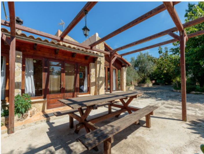
Dining area on the terrace