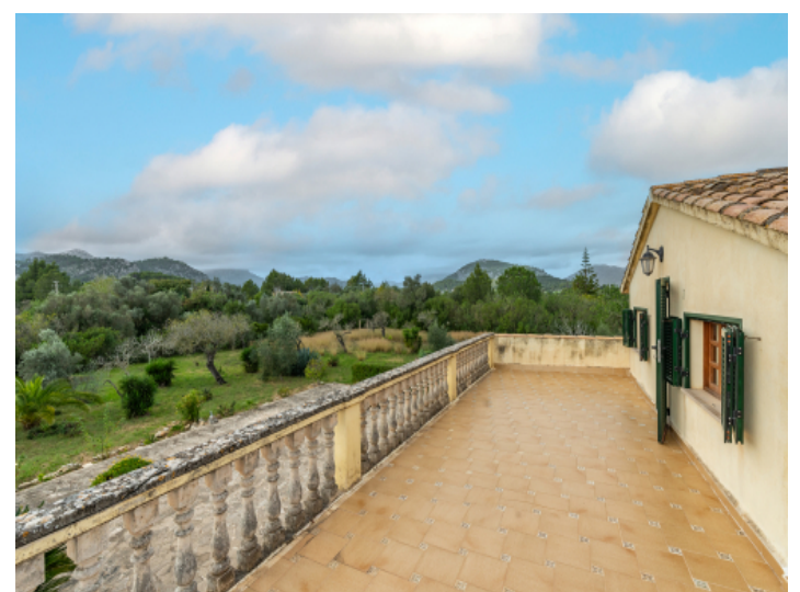
Landscape views from the balcony