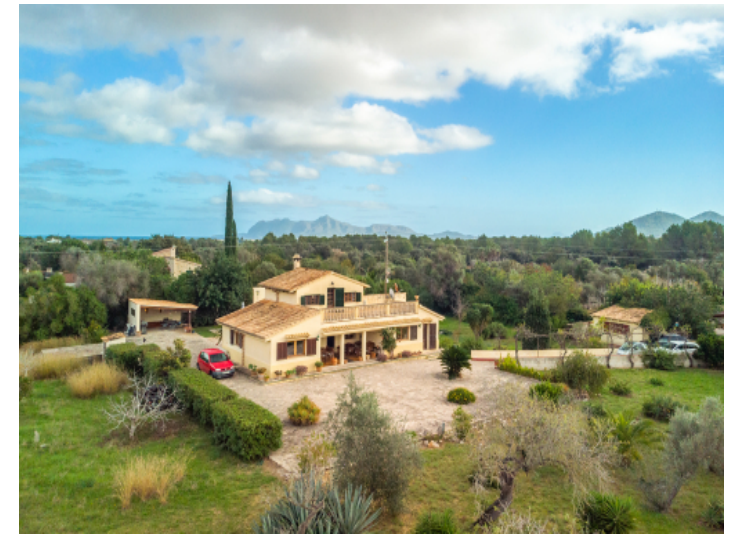
Views from the garden to the villa