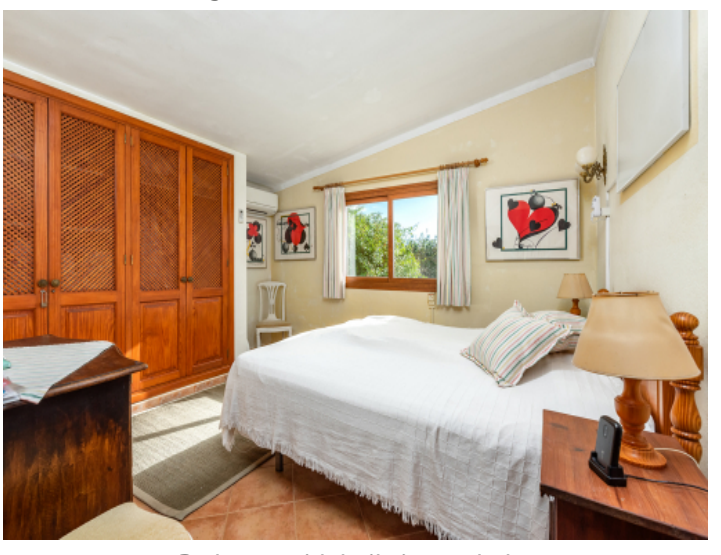
Bedroom with built-in wardrobe