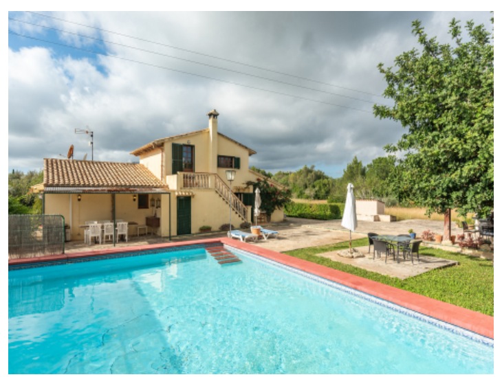
Villa with a large plot and pool in Pollensa