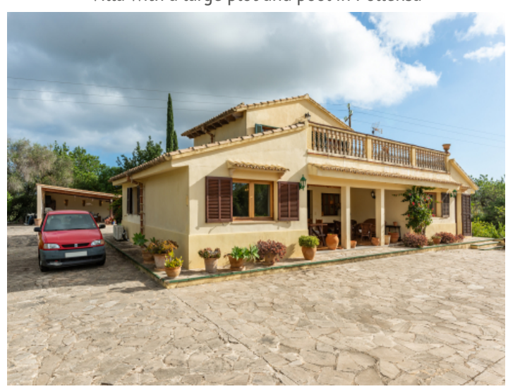
Ample terrace with parking space