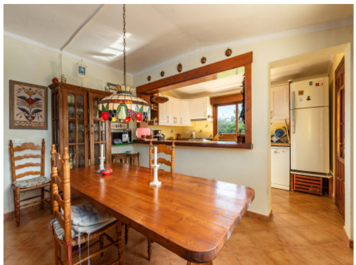
Dining area with views to the kitchen