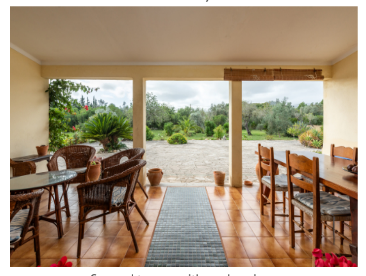
Covered terrace with garden views