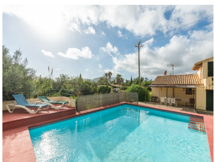
Pool surrounded by a terrace