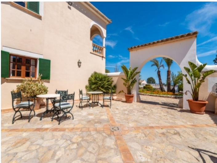
Terrace with dining area