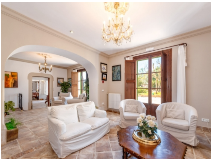
Living area with fire place