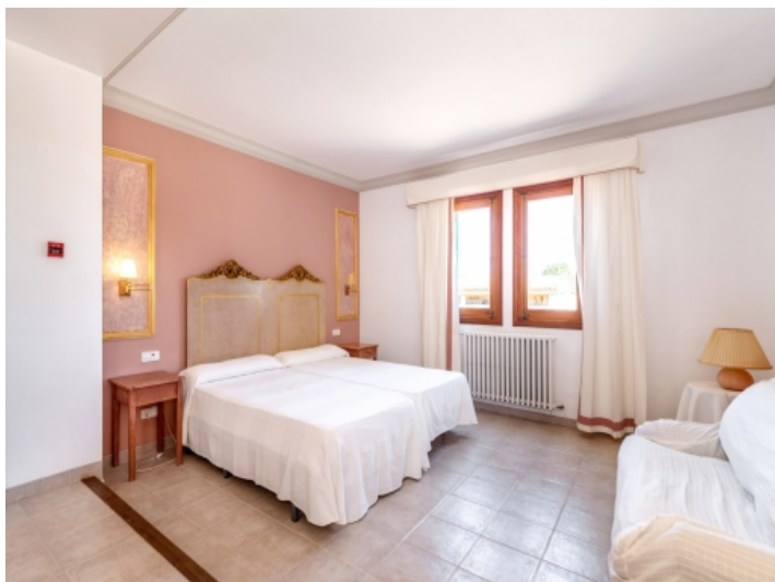
One of 9 bedrooms