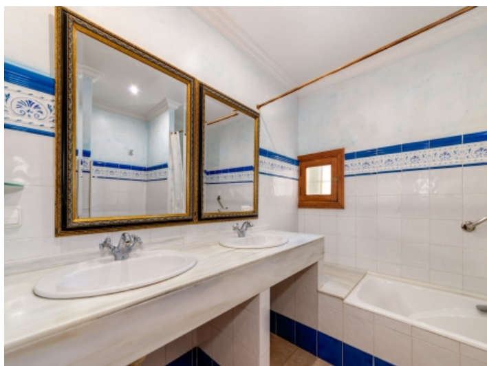
One of 9 bathrooms