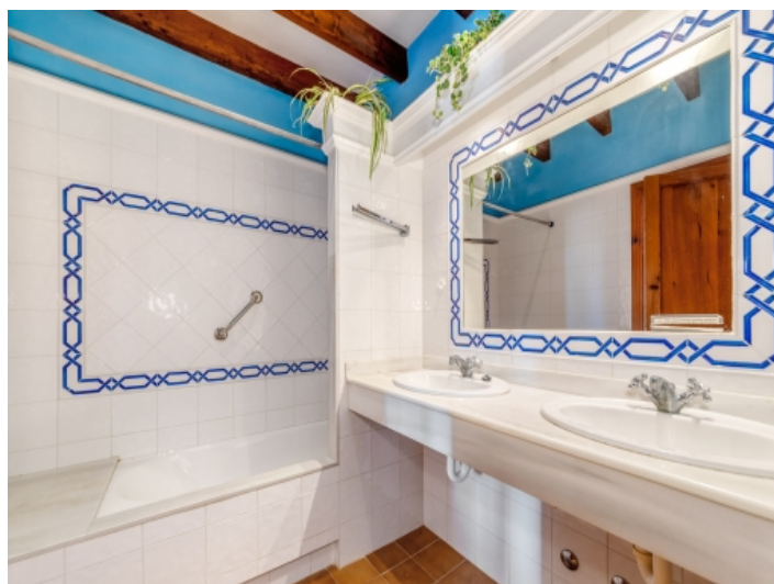
One of 9 bathrooms