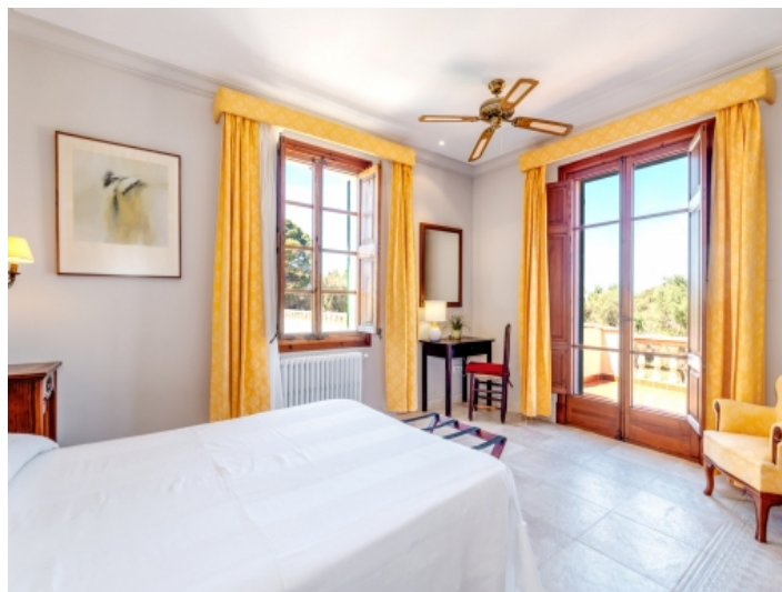
One of 9 bedrooms