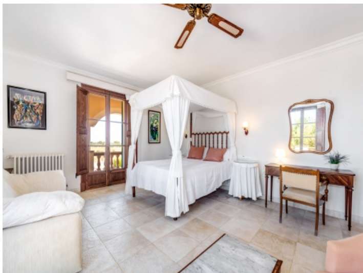
One of 9 bedrooms