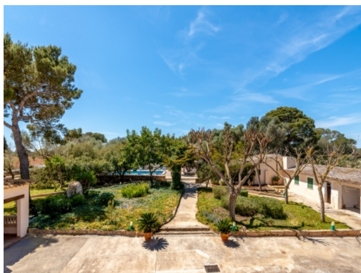
View to the pool area