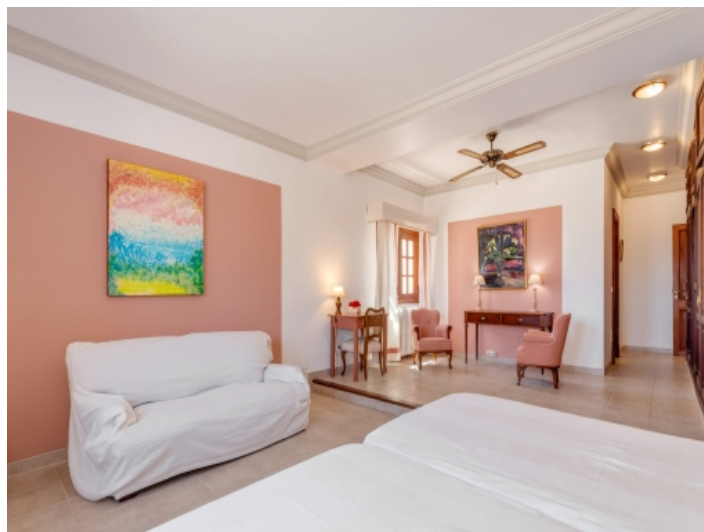
One of 9 bedrooms