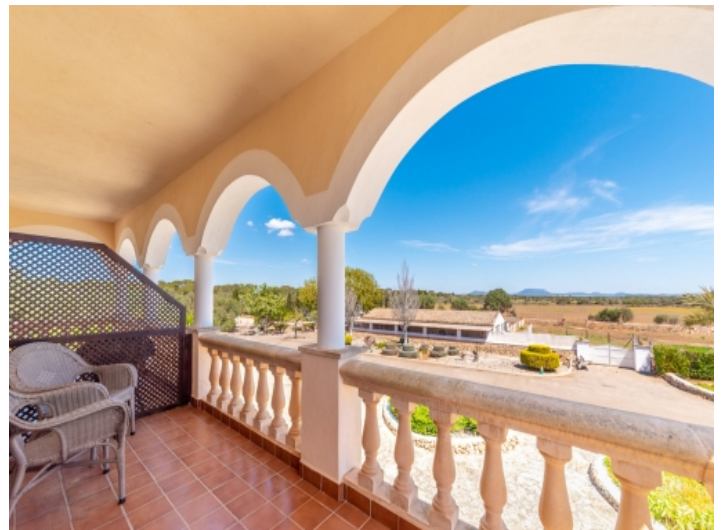
Balcony with a view