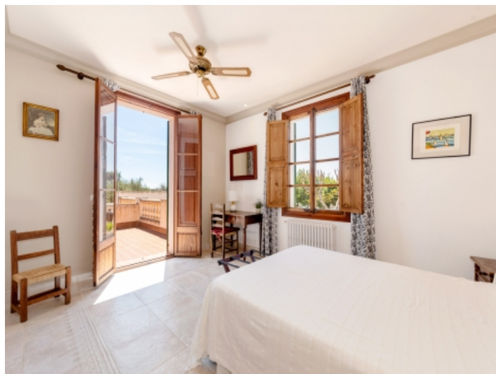
One of 9 bedrooms