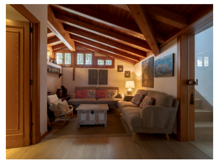
Separate living area