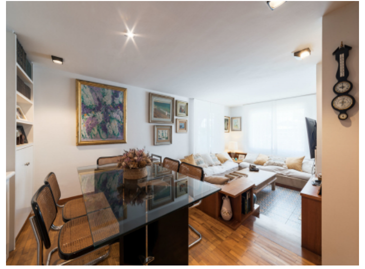
Separate living area