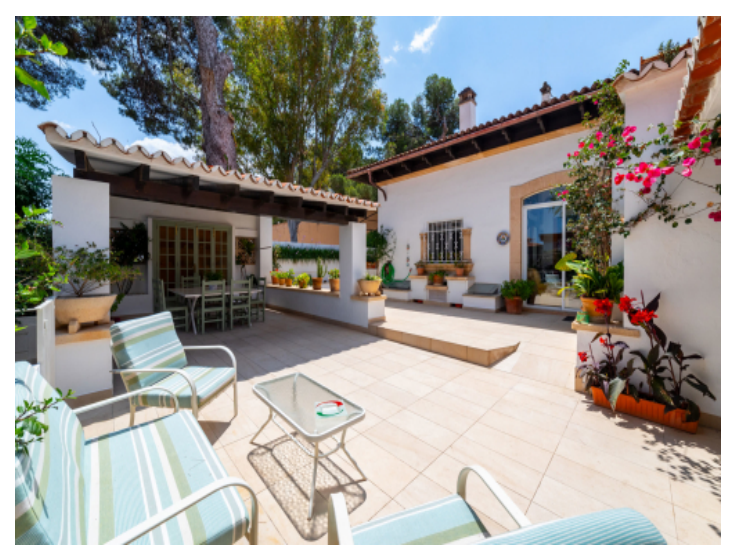
Sunny terrace and dining area