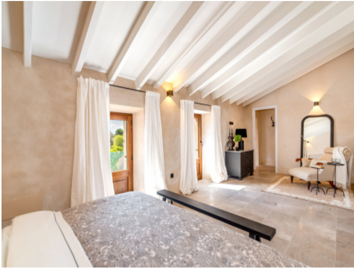
Master bedroom on the upper floor