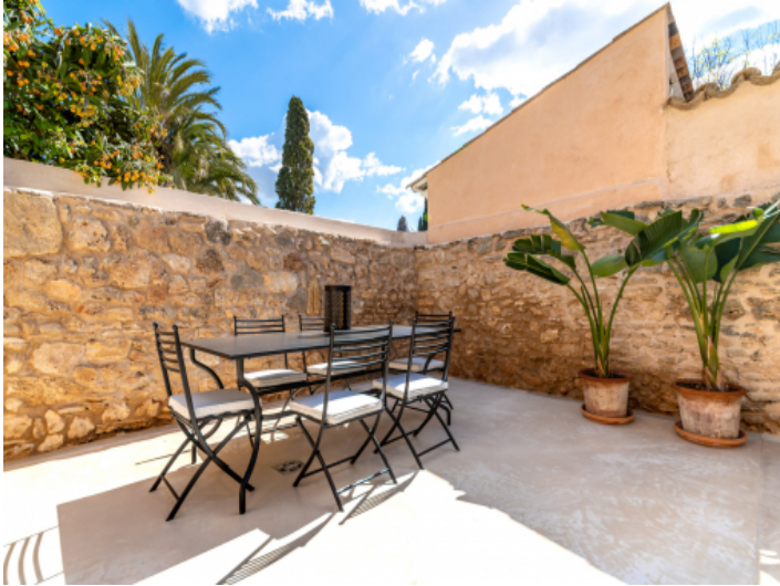
Private outdoor dining area