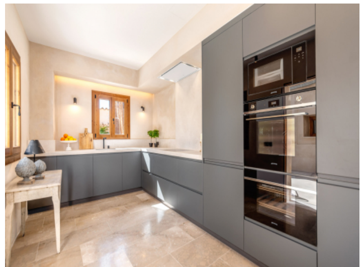
Modern high quality kitchen