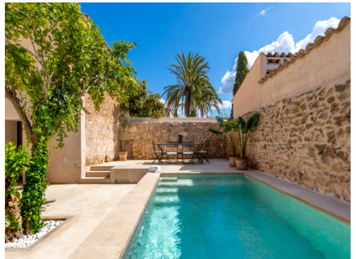
Tranquil terrace next to the pool