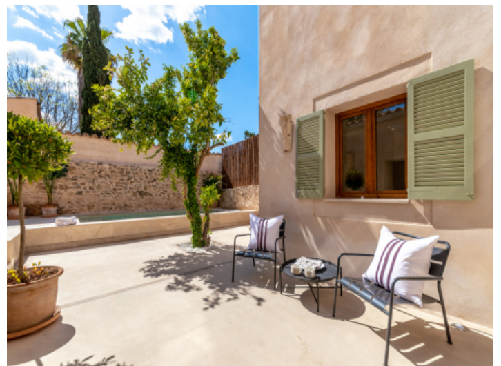
Perfect place to enjoy a coffee