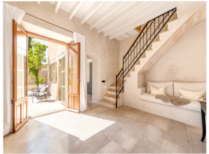
Access to the lovely patio