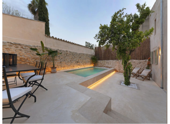
Pool area at night