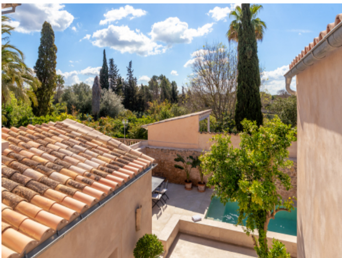
View over the lovely patio