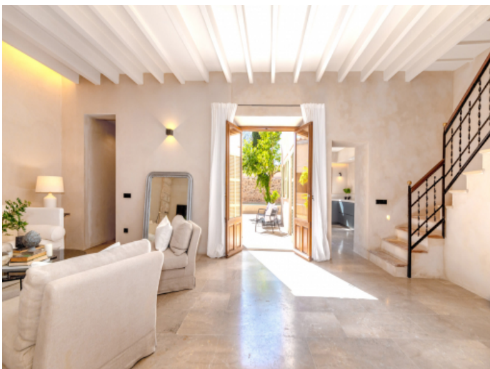
Access to the outside and the kitchen