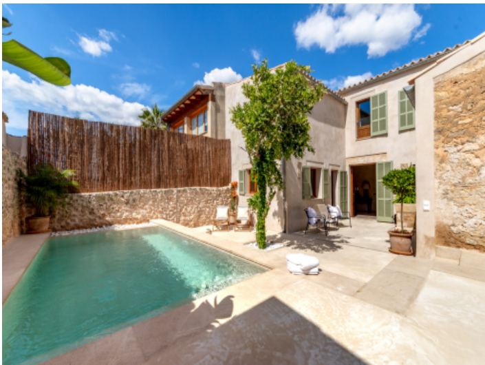
Inviting pool area