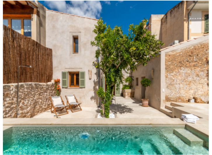
Impressive pool area