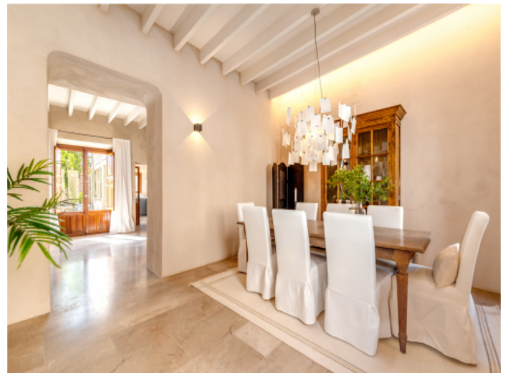
Adjoining dining area