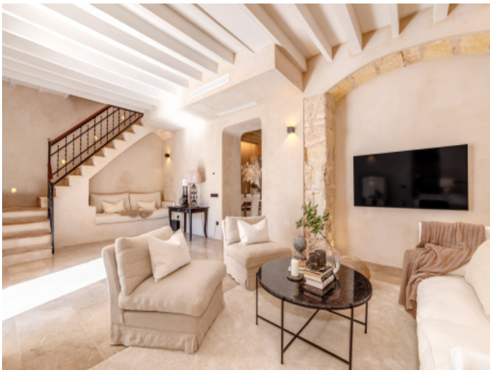
Living area and sandstone colours