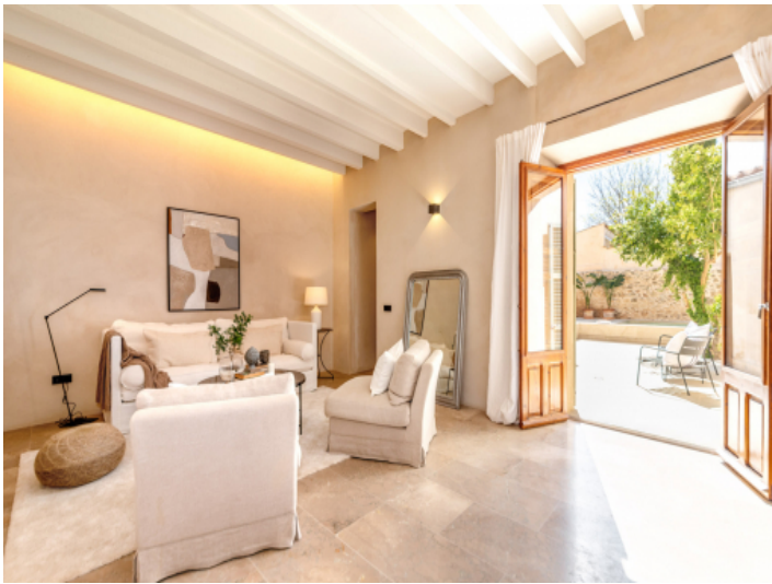
Beautiful bright living area