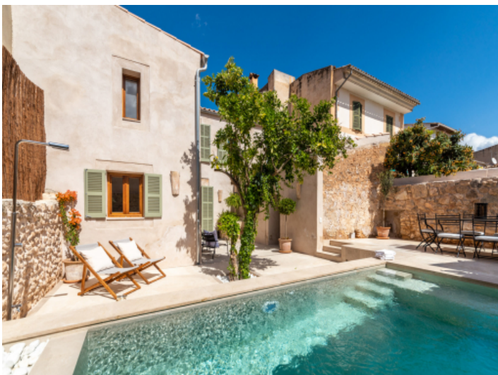
Fantastic outdoor area