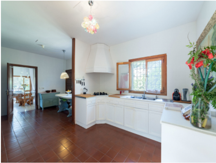
Kitchen in white