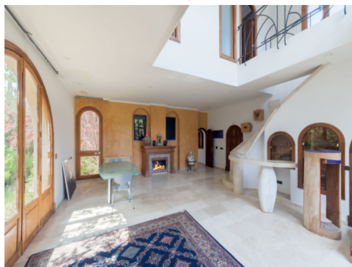
Noble entrance area