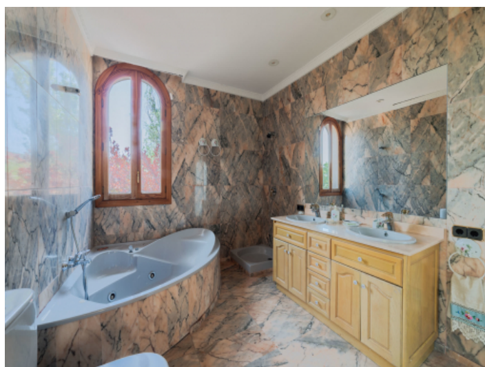
Bathroom with bath tub