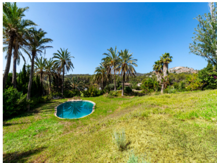
Garden and pool area