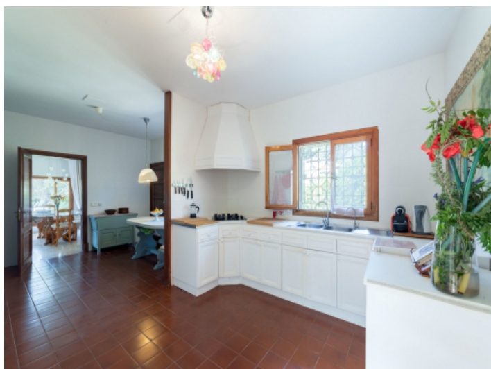
Kitchen in white