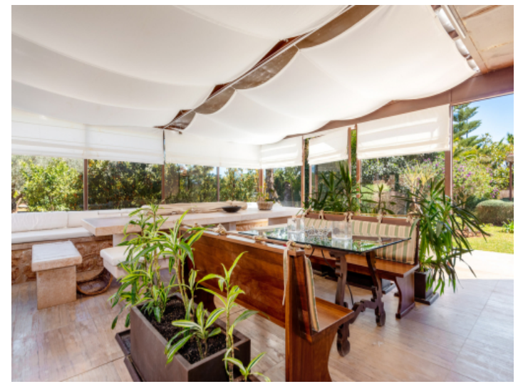
Covered outdoor dining area