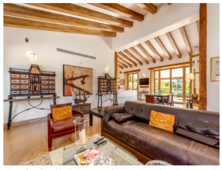
Comfortable living area with wooden ceiling beams