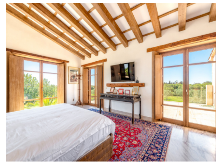
Bedroom with garden views