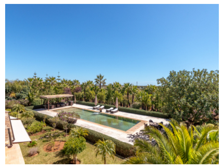
Pool area surrounded by the garden