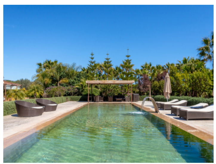
Large pool with terrace