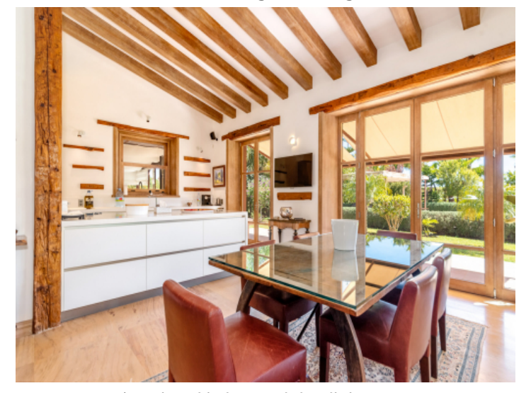
American kitchen and the dining area