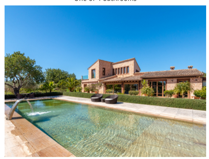
View of the finca with pool