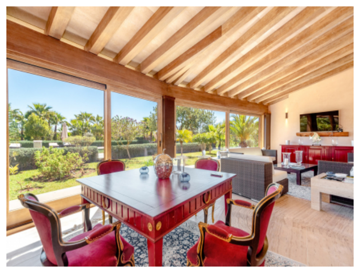
Additional living and dining area