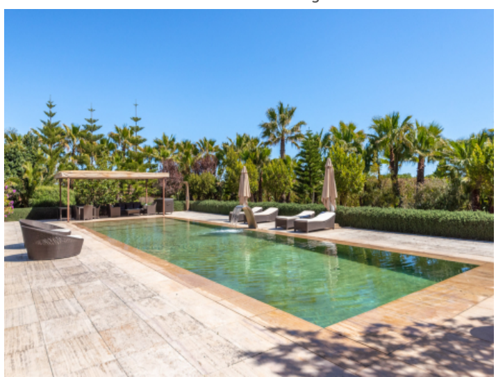
Dreamlike pool area