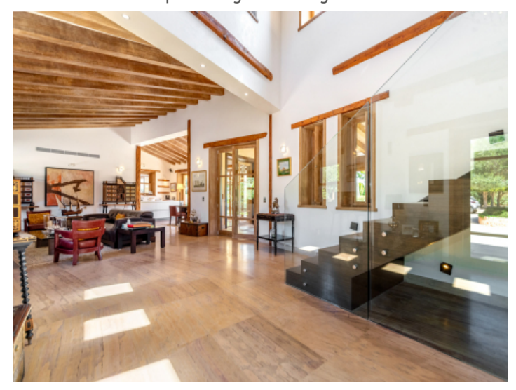
Entrance and living area