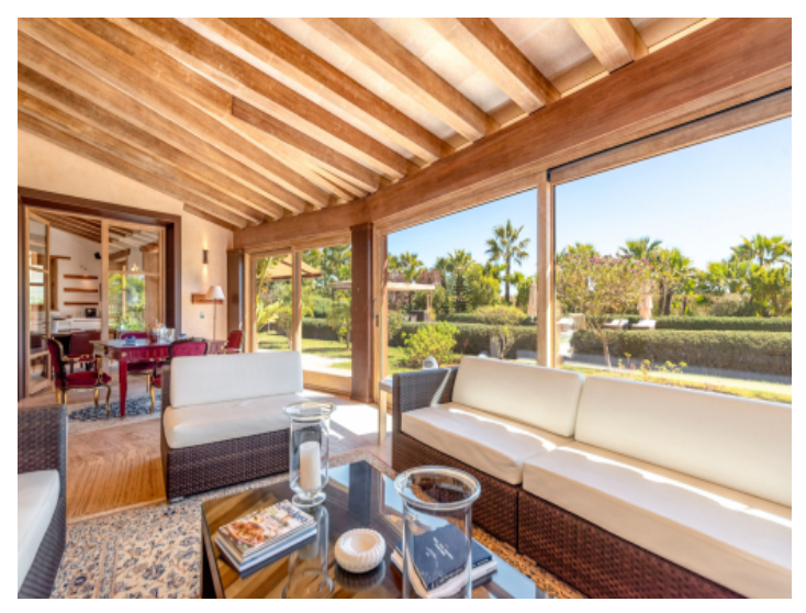
Living area adjacent to a terrace