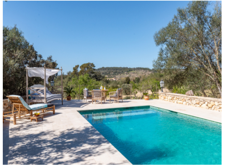
Wonderful pool area