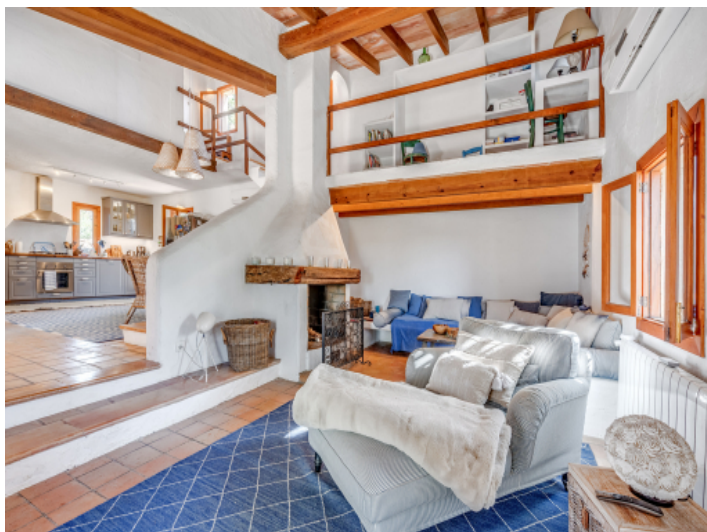
Cosy living area with open fireplace