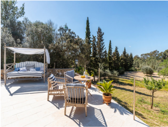
Dreamlike sun terrace with garden views