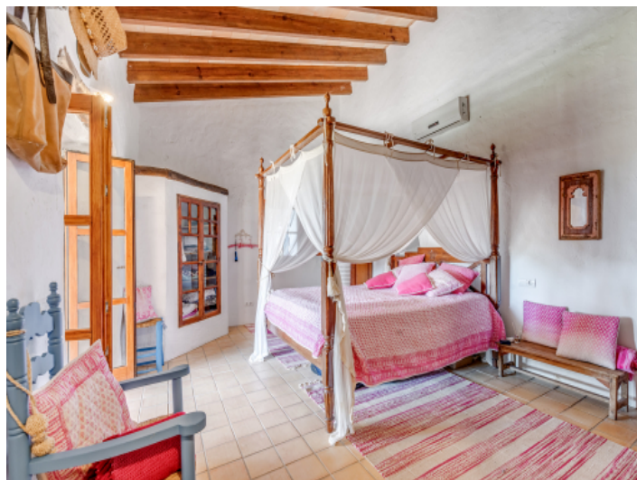
Comfortable bedroom with terrace access