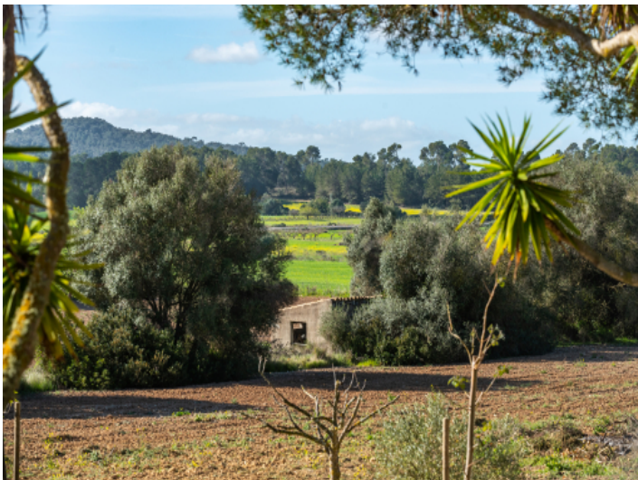
View over the green nature