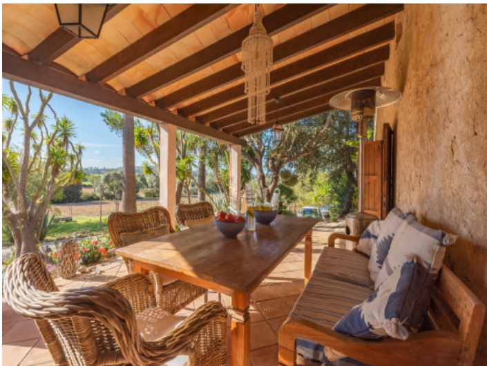
Outdoor dining area with landscape views