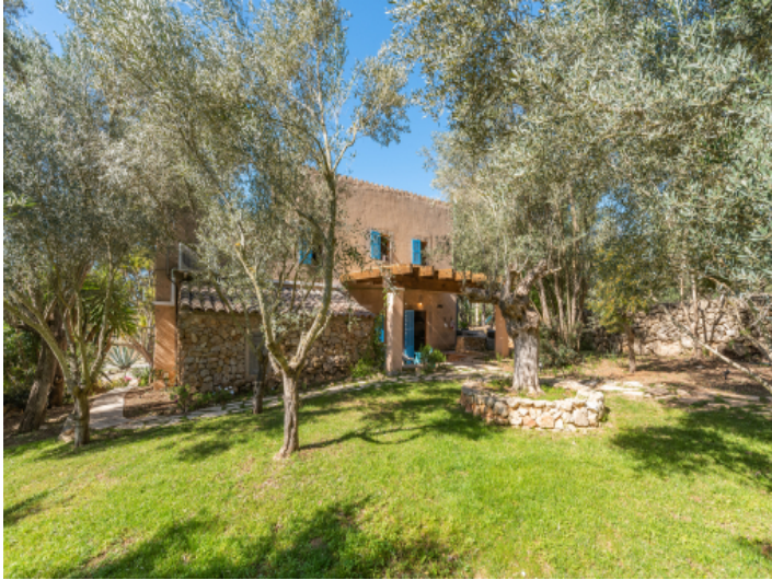
Green mediterranean garden