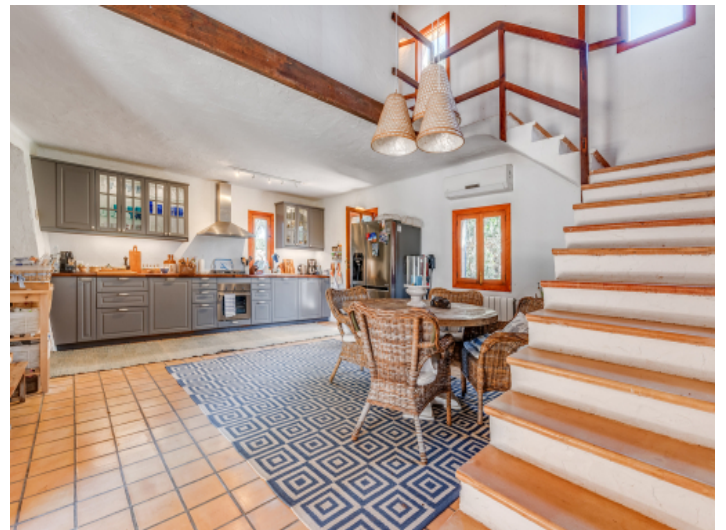
Large, renovated kitchen and dining area