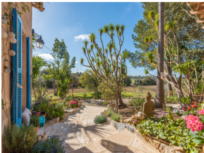
Beautifully laid-out garden with plant