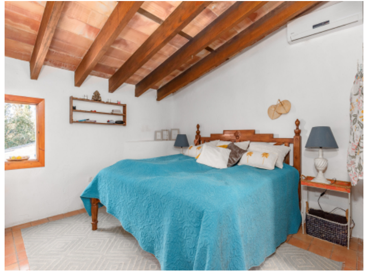
Second double bedrooms