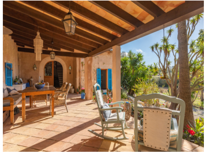
Large, covered terrace and access to the house