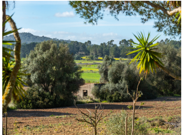
View over the green nature