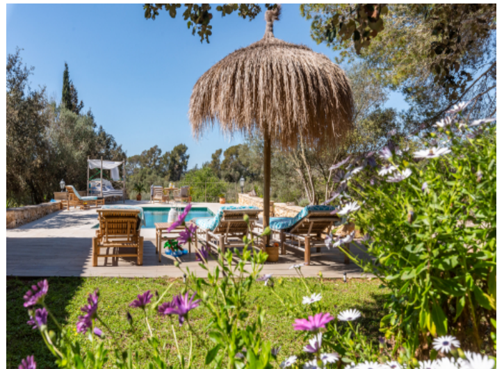
Beautifully located pool and garden