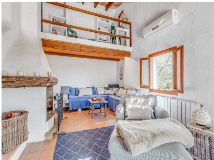
Living area with garden access and upper gallery