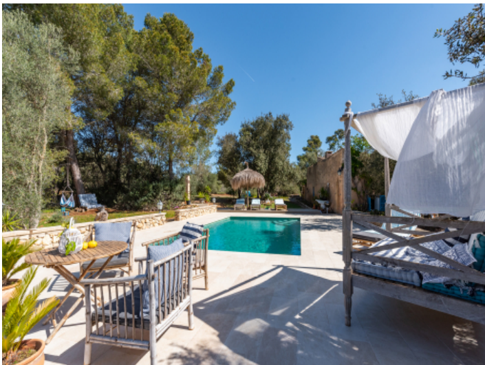
Perfect place for hot summer days