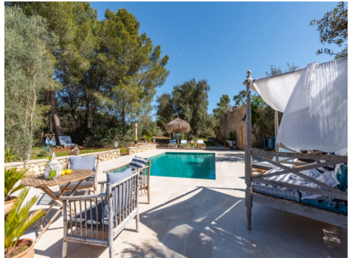
Perfect place for hot summer days