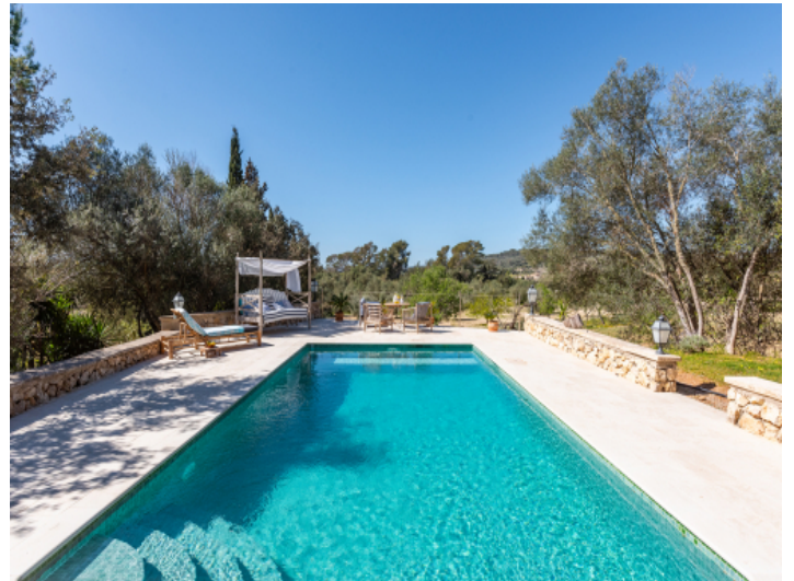
Tranquil pool area in absolute privacy