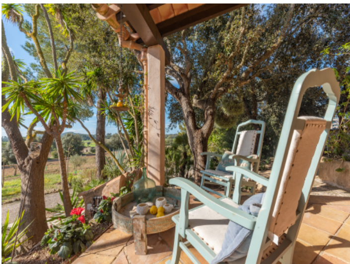
Idyllic seating area