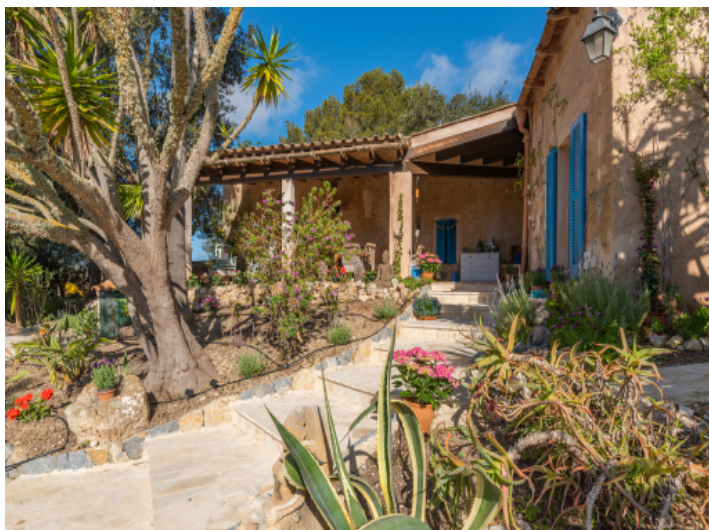
Finca surrounded by a mediterranean garden