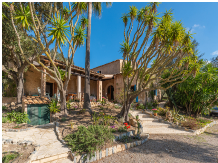
Access and view of the finca