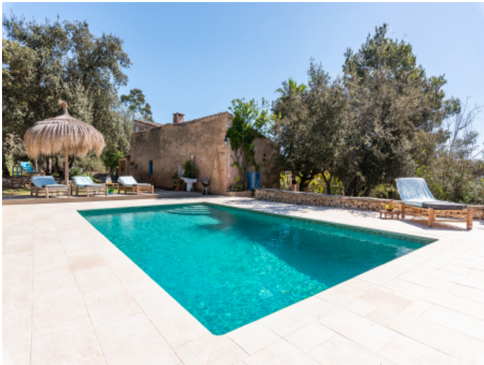
Large pool oasis