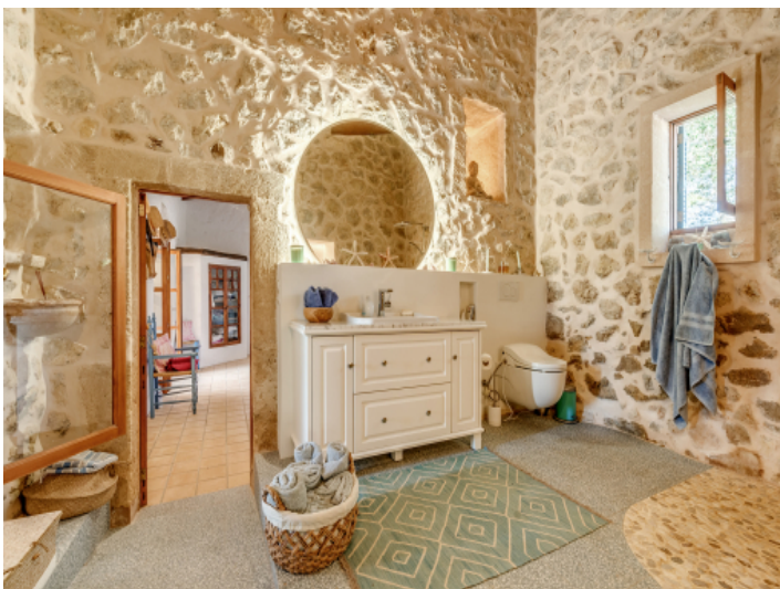
Authentic bathroom with lots of character