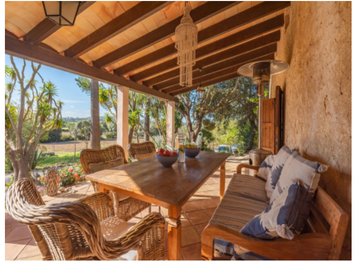
Outdoor dining area with landscape views