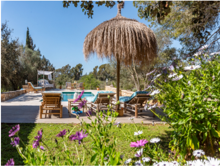
Beautifully located pool and garden