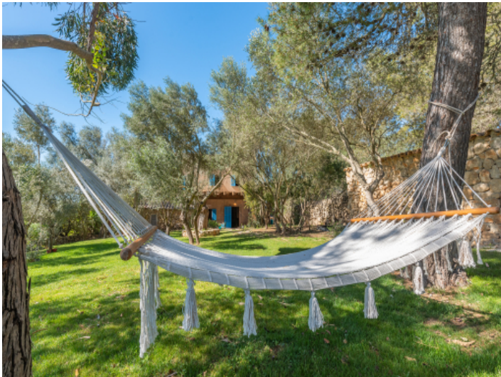
Several areas to relax