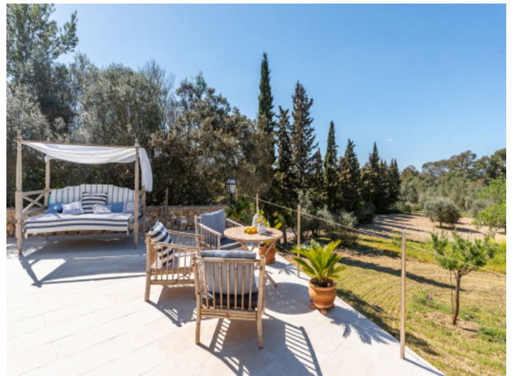
Dreamlike sun terrace with garden views

PORTA MALLORQUINA • C./ COLOM 20 2º, 07001 PALMA, SPAIN