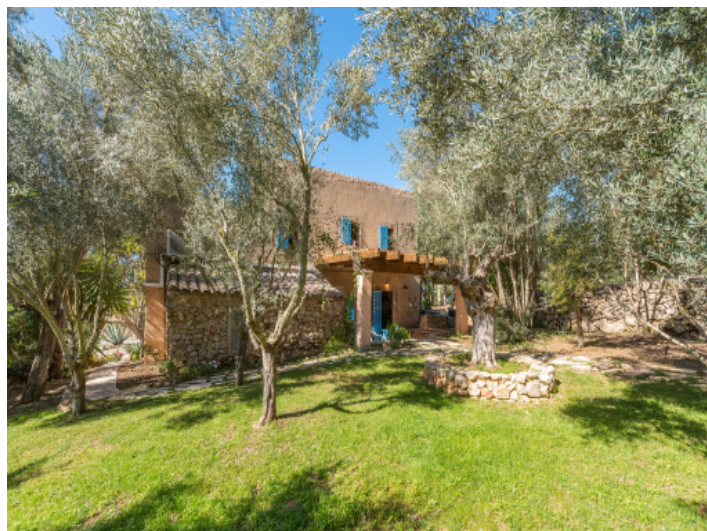
Green mediterranean garden