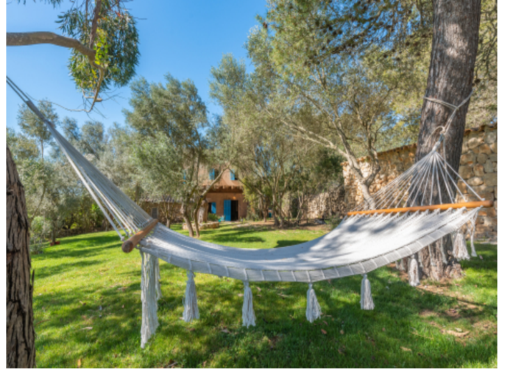
Several areas to relax