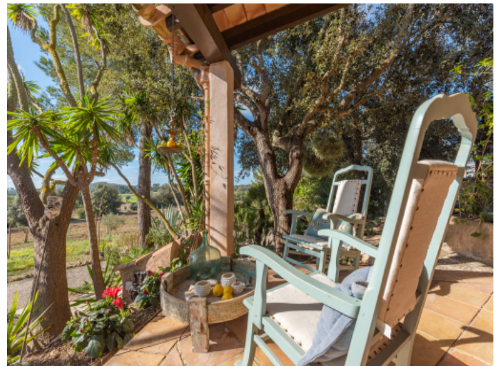
Idyllic seating area