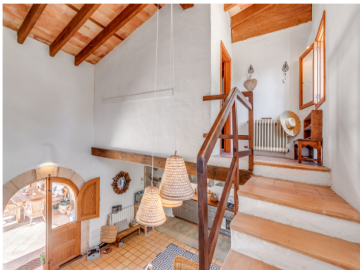
Stairs lead to the upper floor