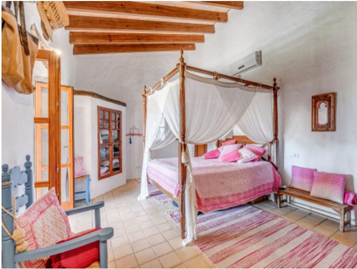
Comfortable bedroom with terrace access