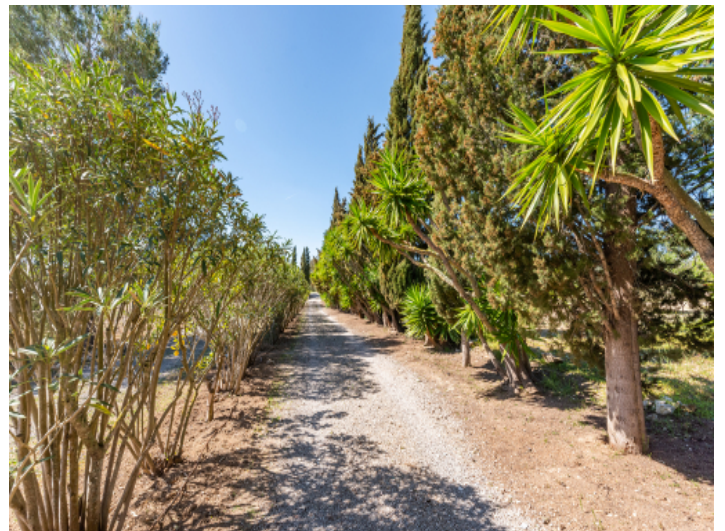
Access to the finca with palm trees