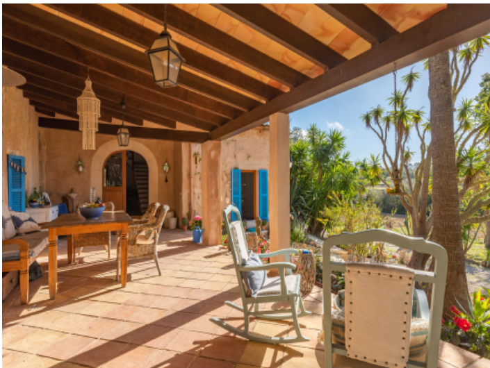
Large, covered terrace and access to the house