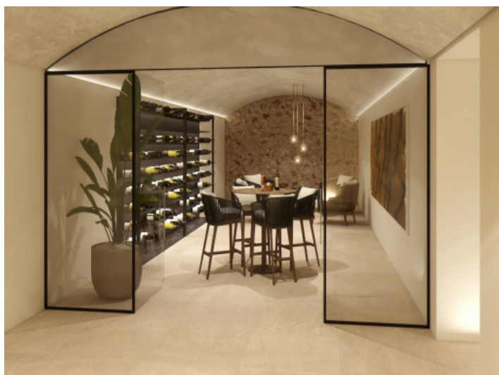
Private wine bodega