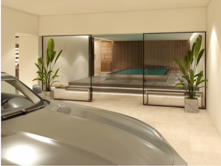
Garage and pool area