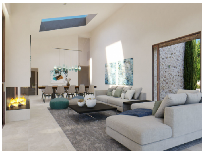
Open living area with fireplace