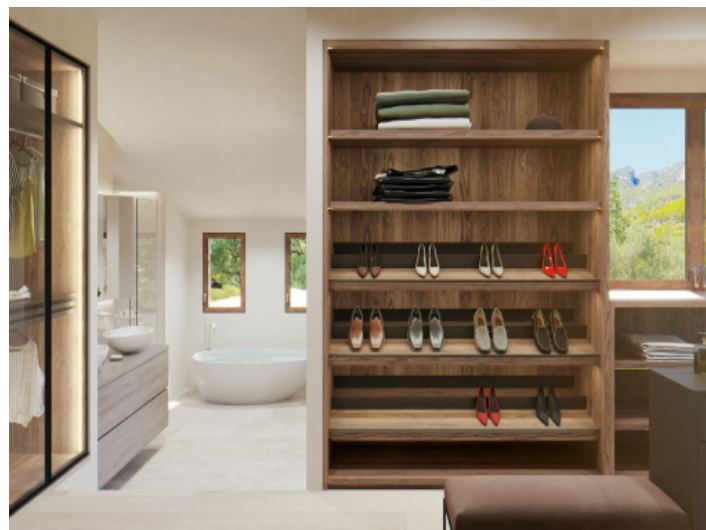
Dressing room with bathroom en suite