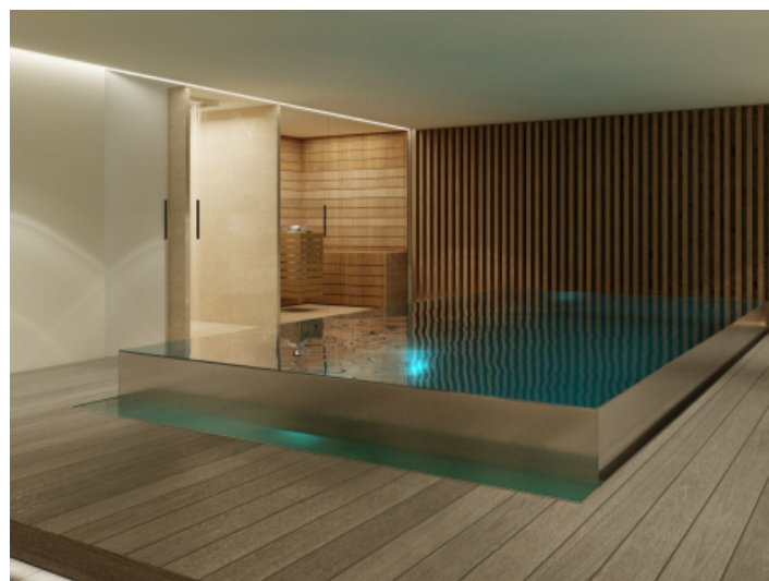
Indoor pool area