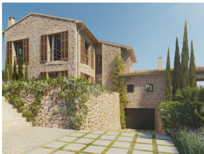
Exterior view and garage