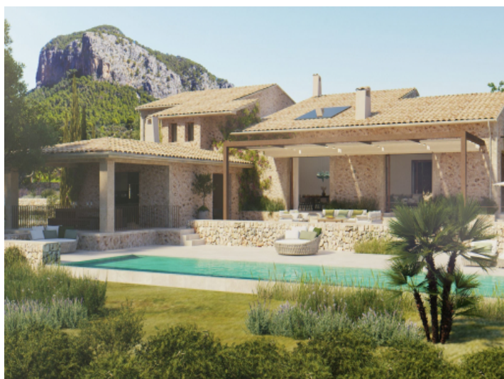
Exterior view and pool