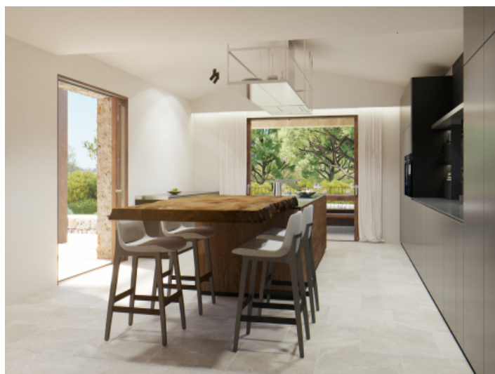
Dining area in the kitchen