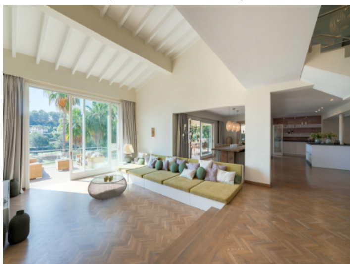
Large, light-flooded living area