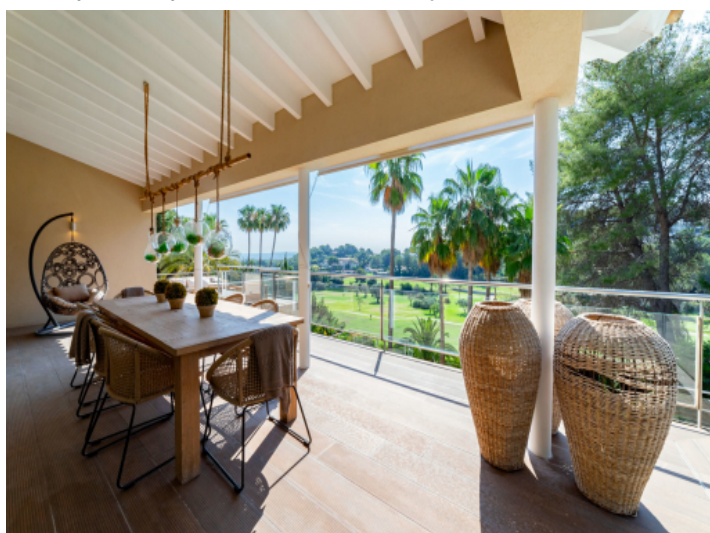
Covered terrace with outdoor dining area