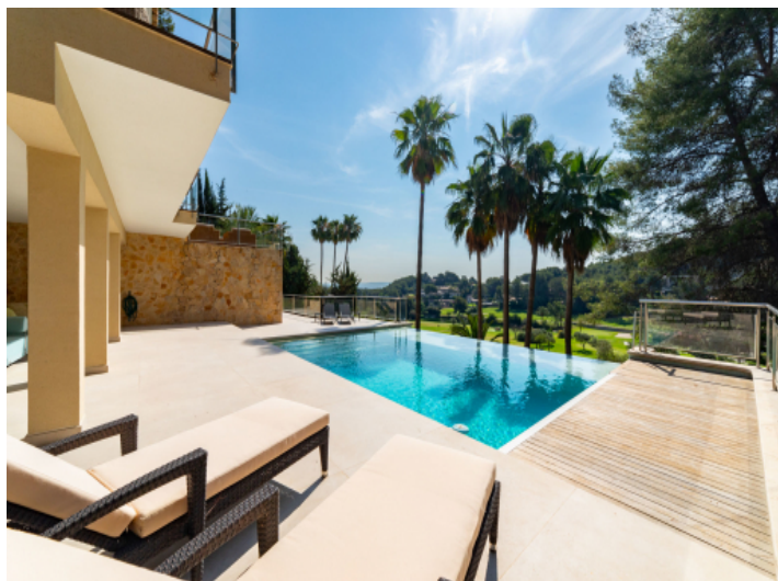
Family-friendly villa in Son Vida with pool and excellent views