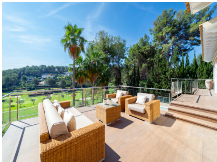
Sunny terrace with a stunning view