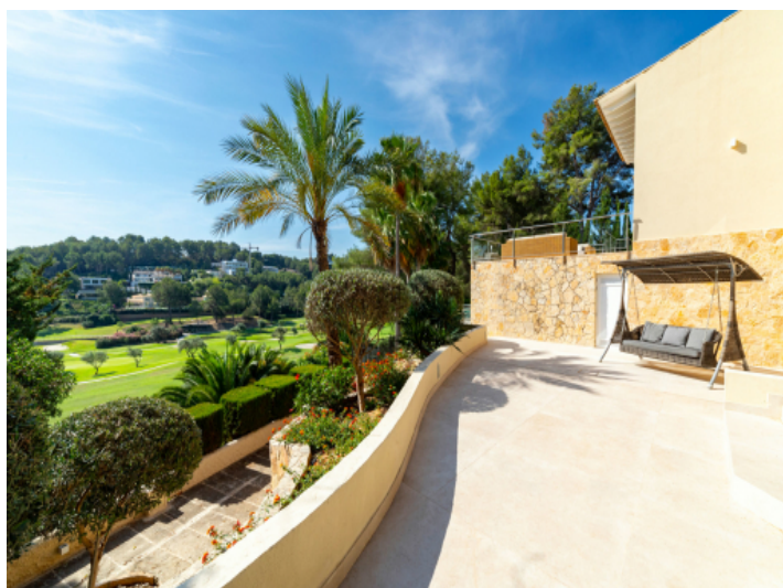
Sunny terrace overlooking the golf course