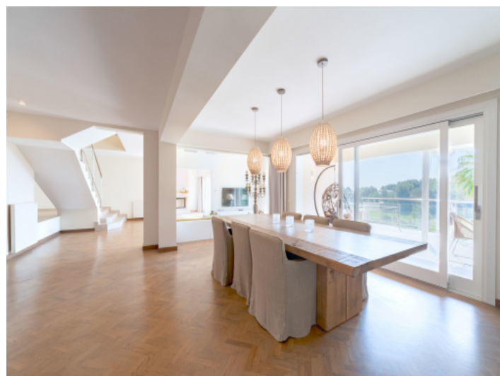
Elegant dining area