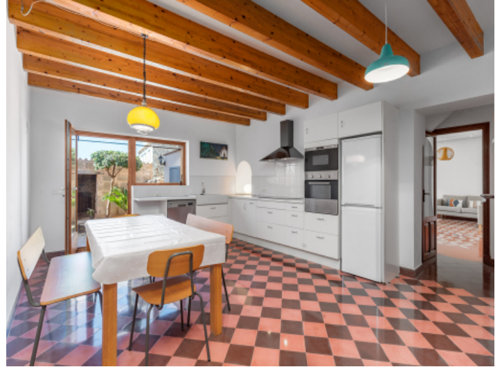
Modern kitchen and dining area