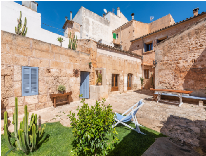
Patio and small garden