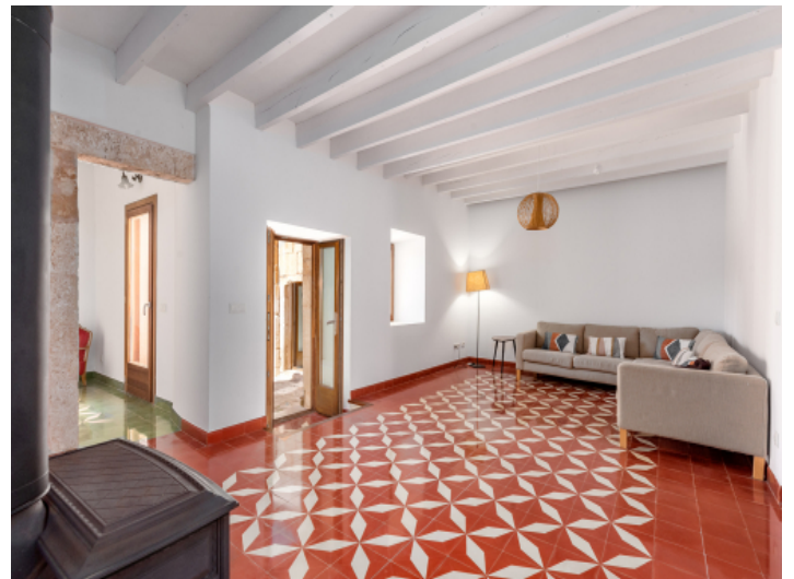
Large living area with terrace access