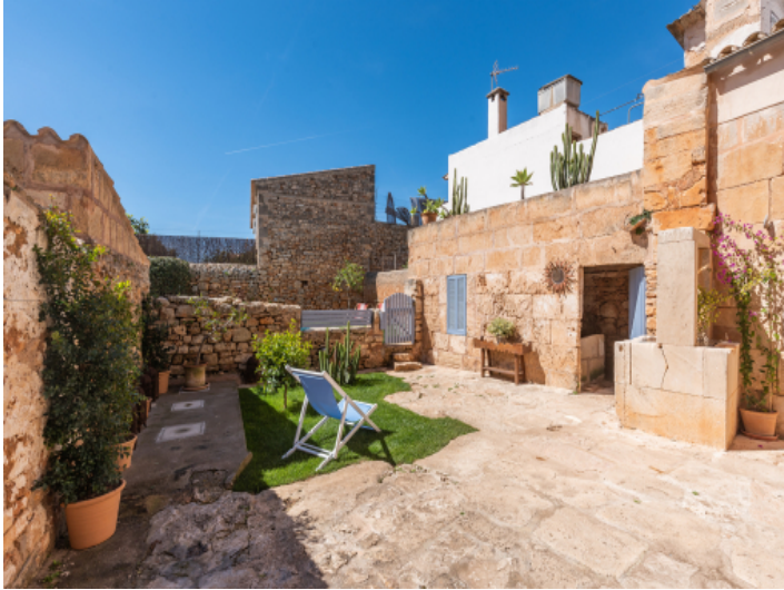
Access to the pool and garden area