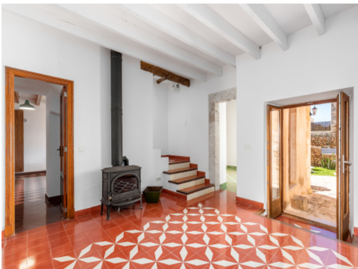
Access to the outside and stairs to the upper floor