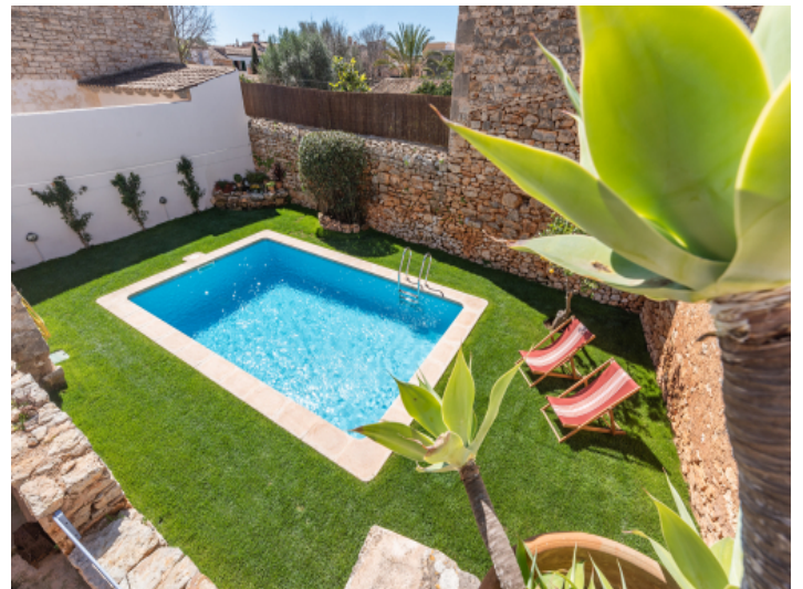
View to the beautiful pool area