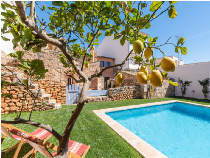
Wonderfully laid-out garden with pool