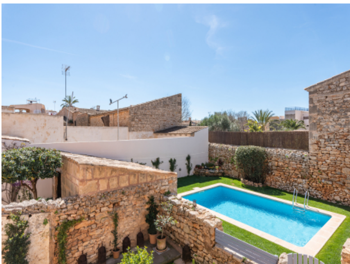
View from the upper terrace