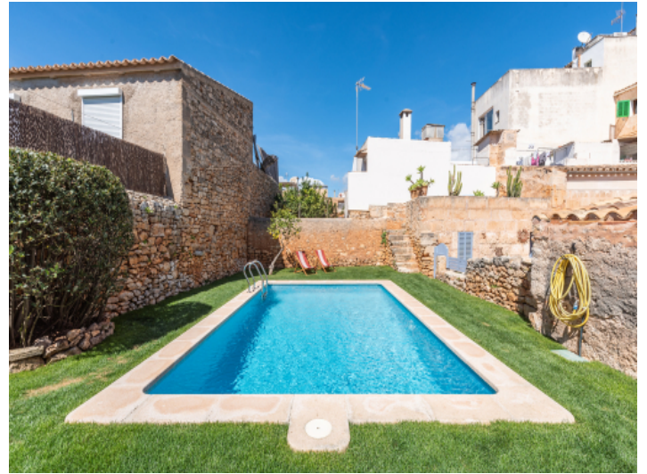
Enchanting and fenced in pool area