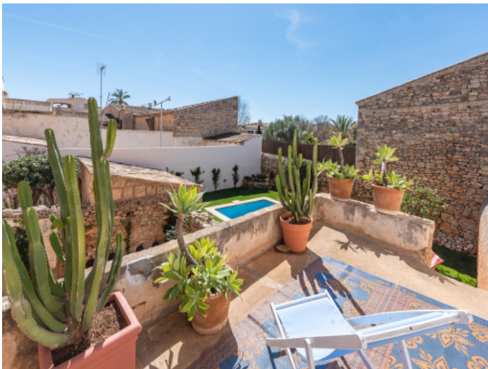
View from the upper sun terrace