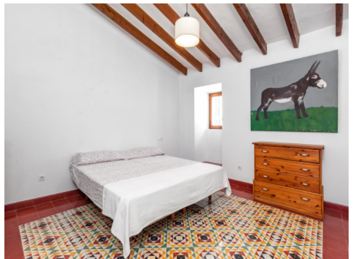
Bedroom with lots of character