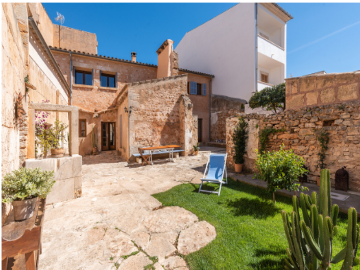
Lovely patio with garden and terraces