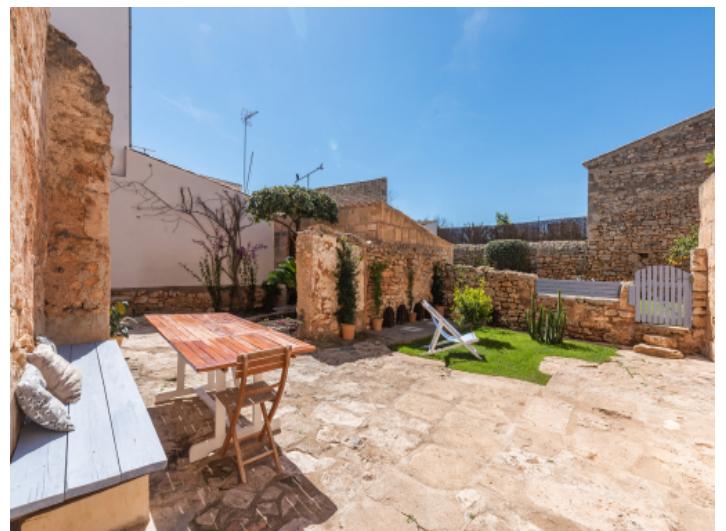
Spacious patio with outdoor dining area