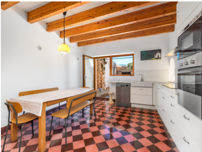
Further access to the outdoor area