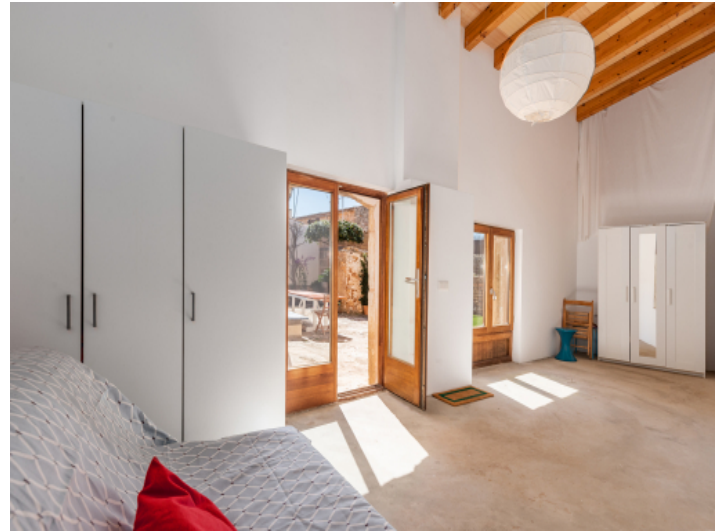
Separate guest room with access from the patio