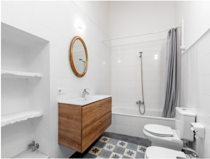
One of 2 bathrooma