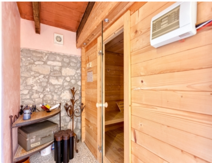
Spa with sauna