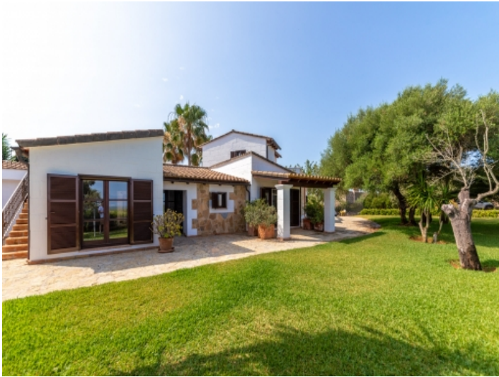
Exterior view and garden