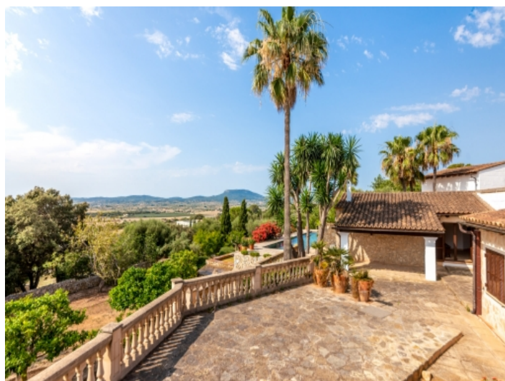
Terrace and landscape views