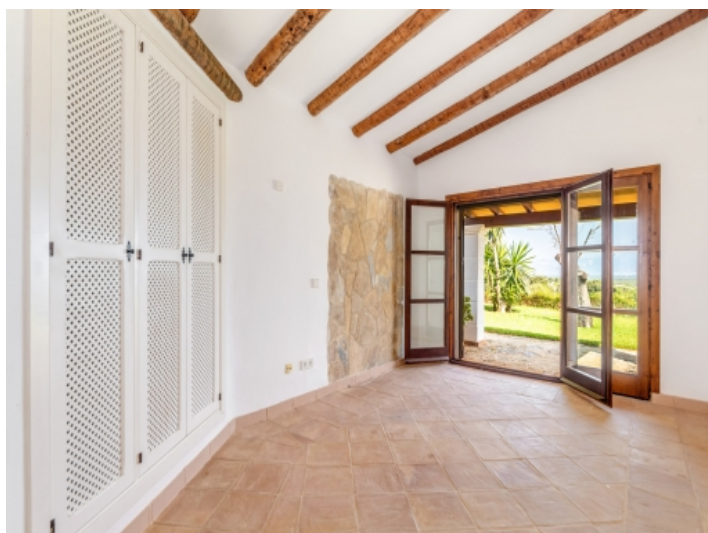
Bedroom with built-in wardrobes