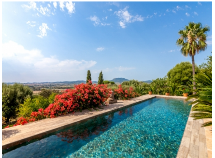
Pool area with a view