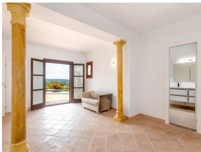
Bedroom suite with bathroom en suite