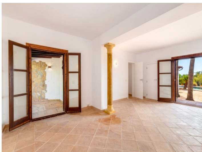
Alternative view of the bedroom