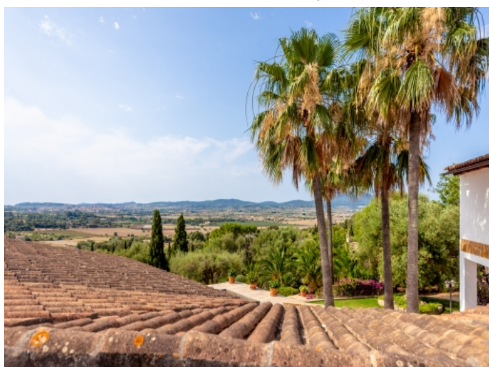
View into the landscape