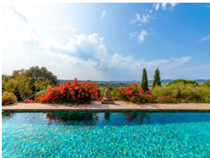
Pool with fantastic landscape views