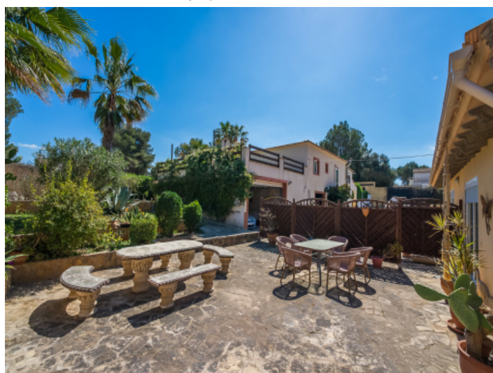
Large sunny terrace