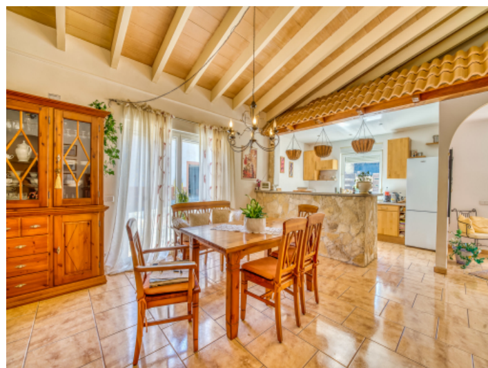
Dining area adjacent to the kitchen