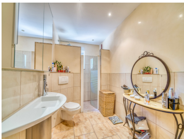
Bathroom with walk-in shower