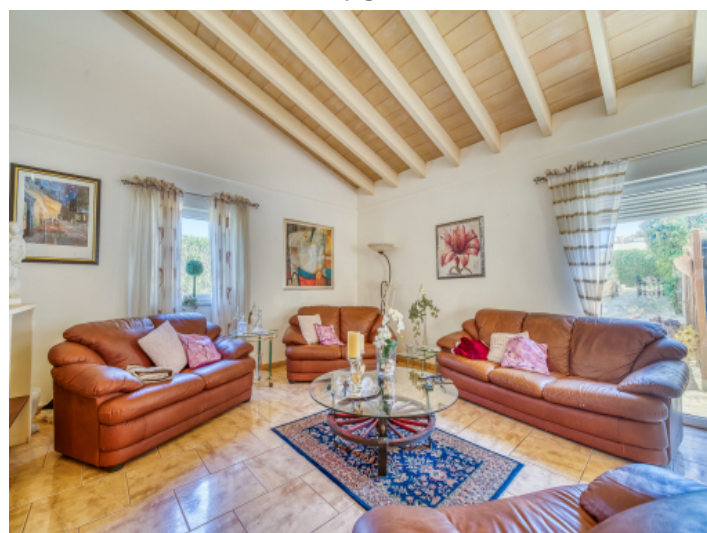
Cozy living room