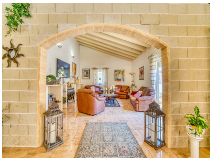
Beautiful living room