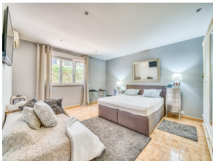
Very spacious bedroom