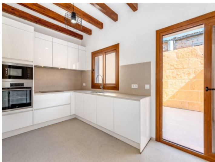
Access to the patio