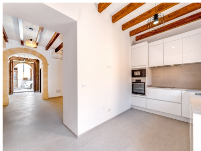
Modern kitchen in white