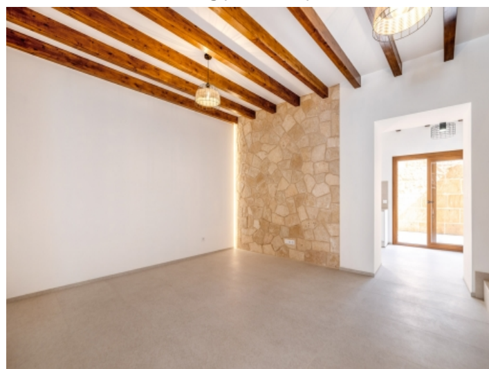
Cozy living area with natural stone wall