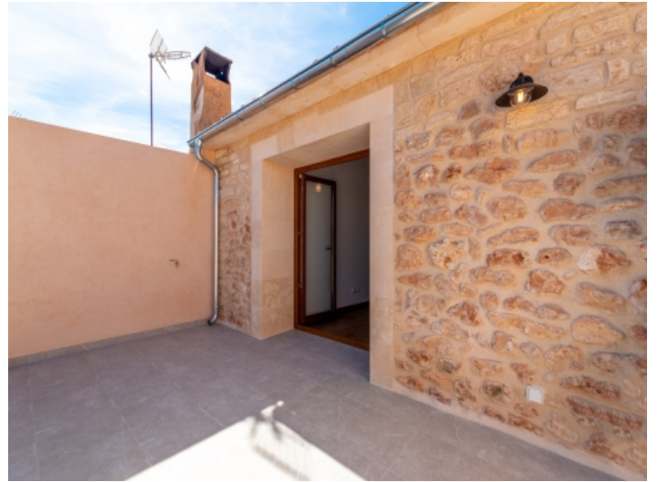
View of the balcony