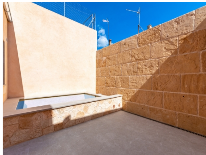
Inviting patio with pool