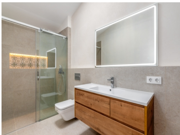
Bathroom with walk-in shower