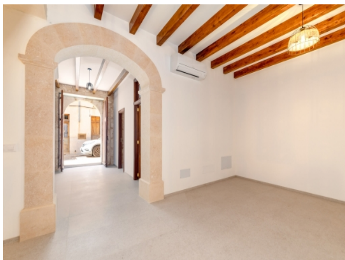
View to the entrance area