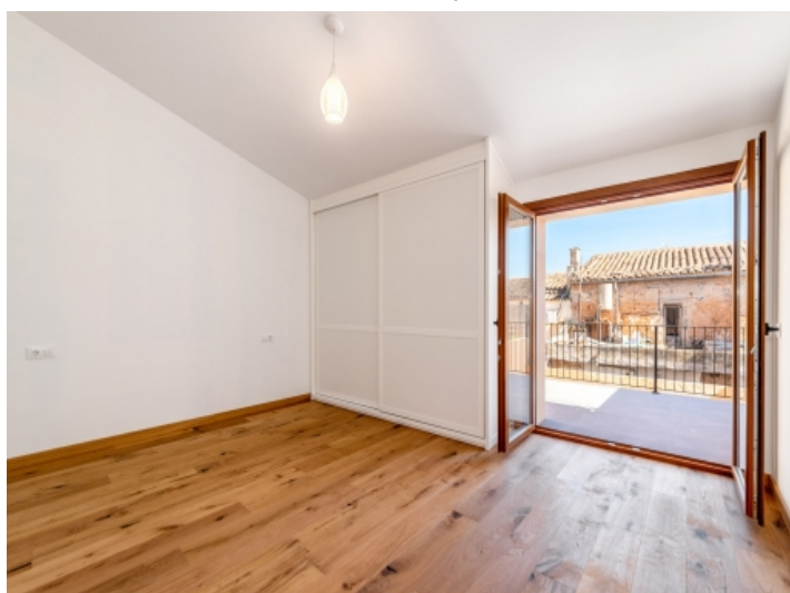
Main bedroom with balcony access