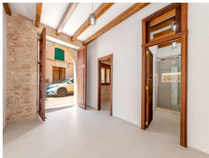
Entrance area and guest bathroom