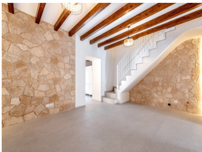
Cozy living area with natural stone wall