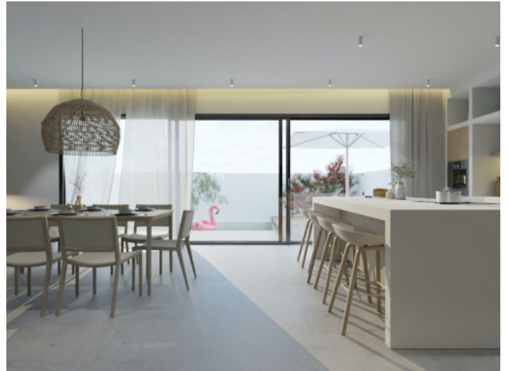
Living and dining area