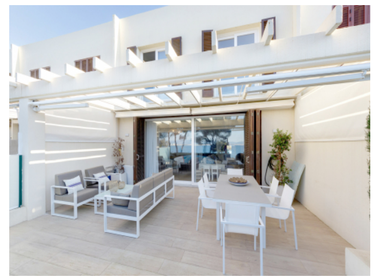
Fantastic sea view terrace