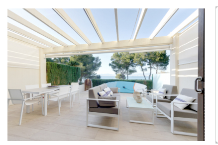
Son Veri Nou search for property MAL-119595