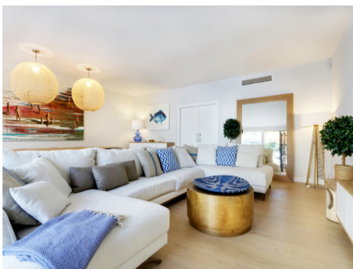
Comfortable living area