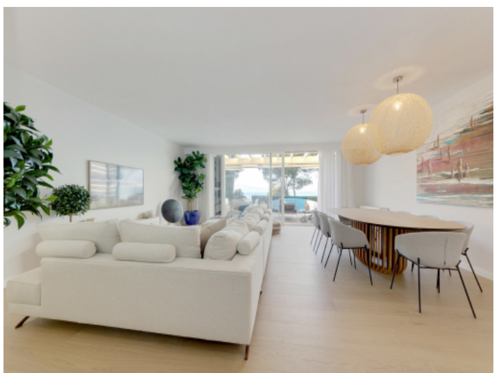
Living and dining area with terrace access