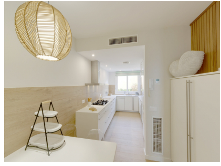
Kitchen with breakfast area

PORTA MALLORQUINA • C./ COLOM 20 2°, 07001 PALMA, SPAIN TEL.: +34 971 698 242 • INFO@PORTAMALLORQUINA.COM • WWW.PORTAMALLORQUINA.COM