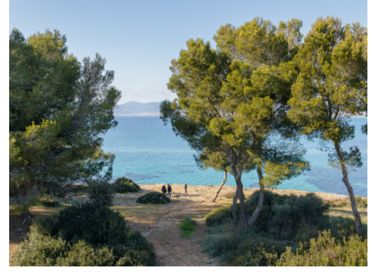
Located in first sea line