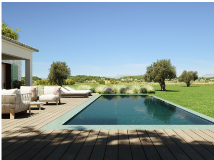
Pool area with sweeping views