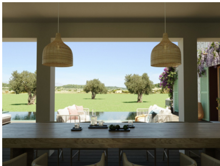
Covered veranda with garden views