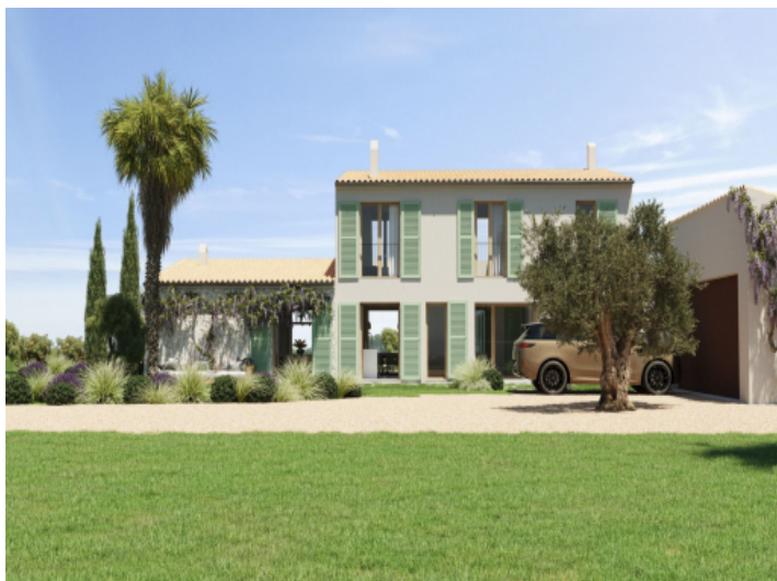
Sideview of the finca and garage