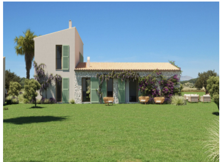
Exterior view and garden