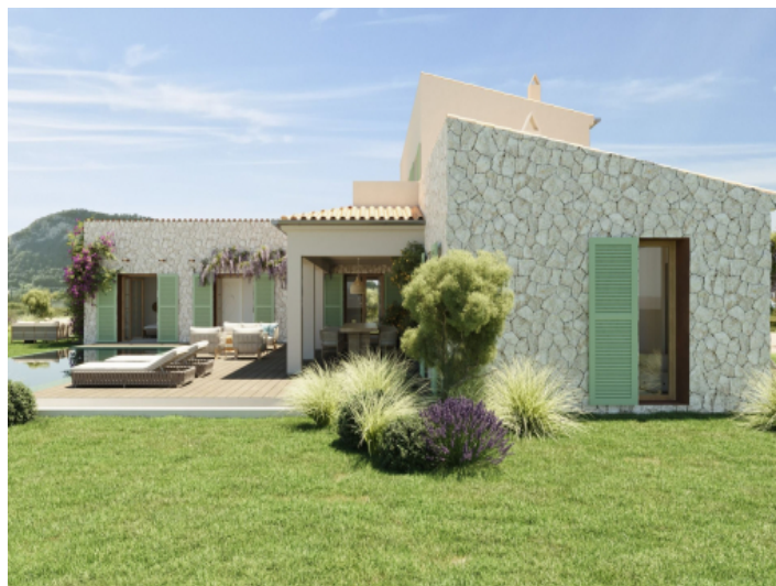
Mediterranean terrace and garden