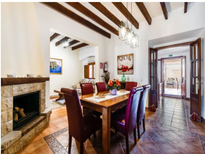
Living area on the ground floor