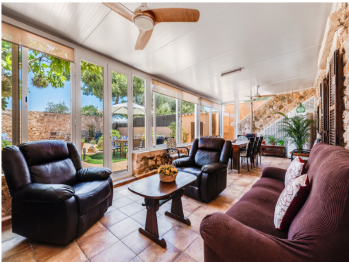
Wintergarden with dining area