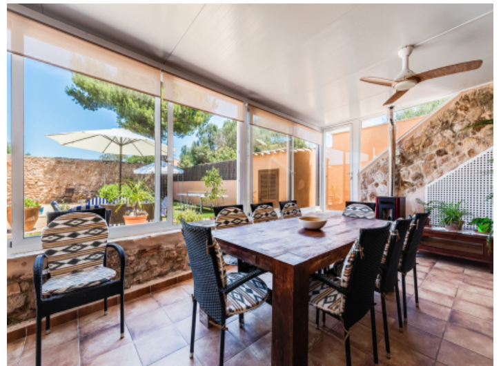
Wintergarden with dining area