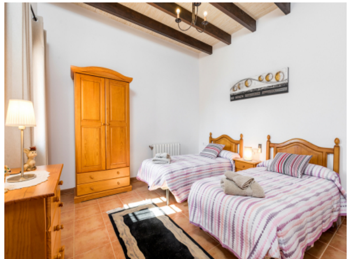
Bedroom with 2 single beds