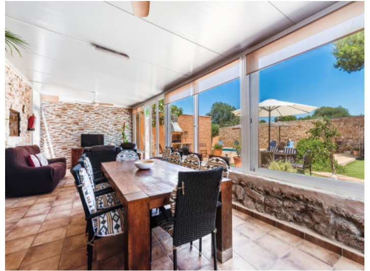
Wintergarden with dining area