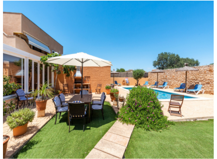
Garden and pool area