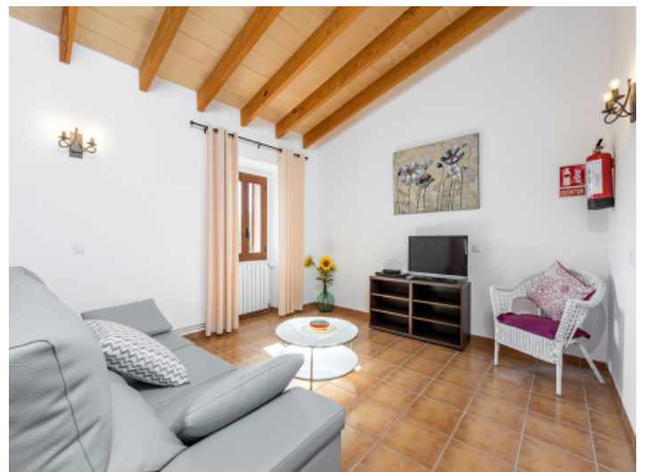
Light-flooded living area on the upper floor