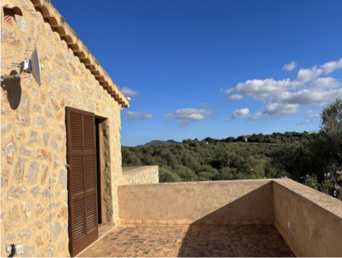
Balcony with a view