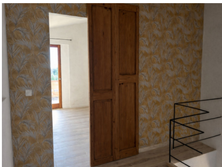
Third bedroom upstairs with private balcony