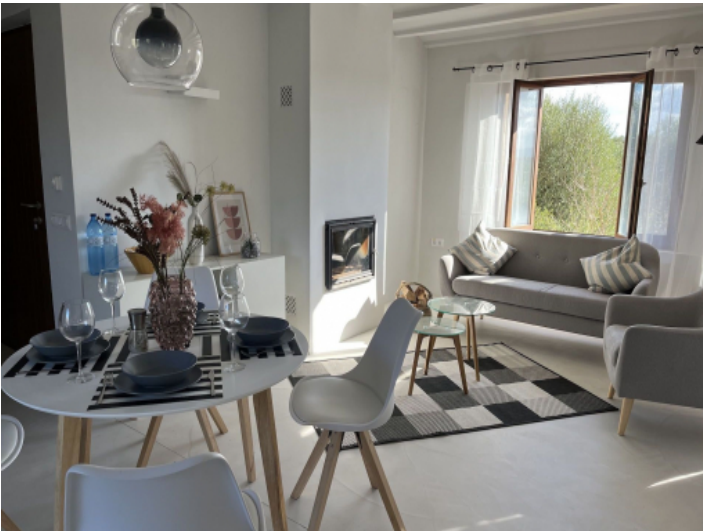
Light flooded living and dining area