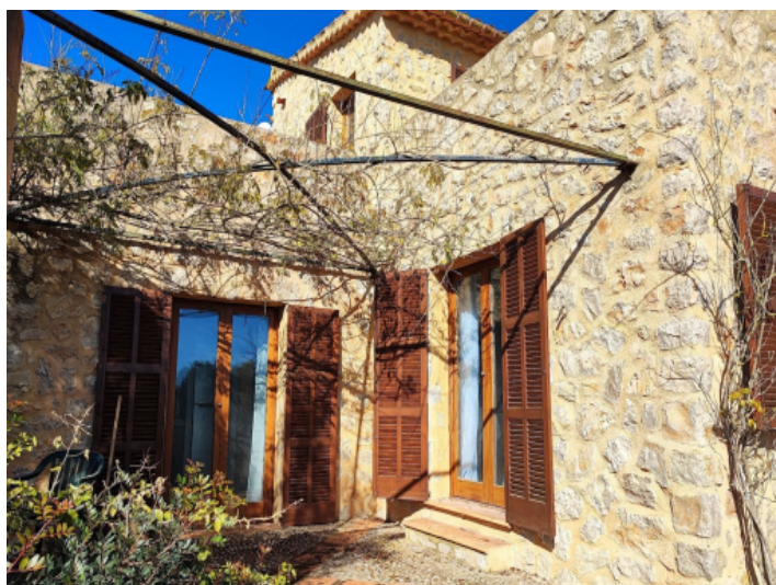
Patio of the finca