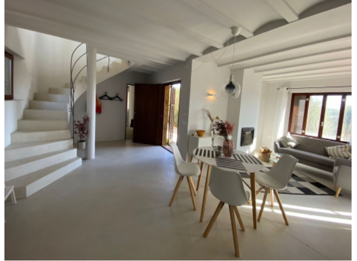
Light flooded living and dining area