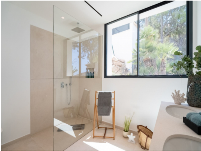
One of 5 bathrooms