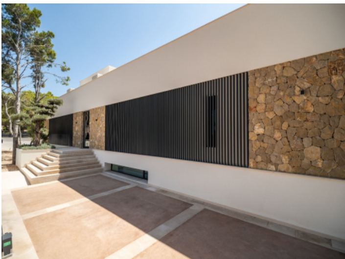
Front facade and parking space