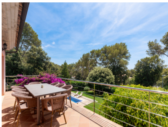
Terrace first floor