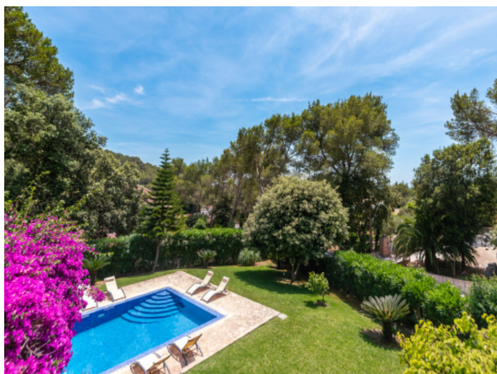
View to the garden and pool