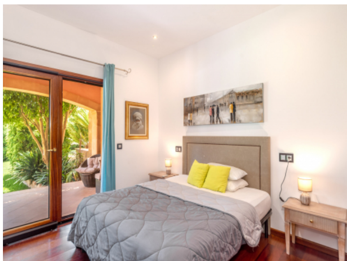
Bedroom on the groundfloor