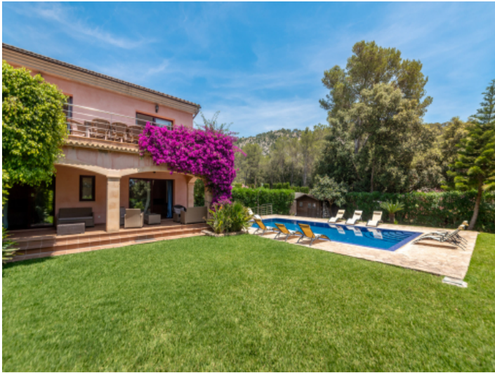
Very well mantained garden