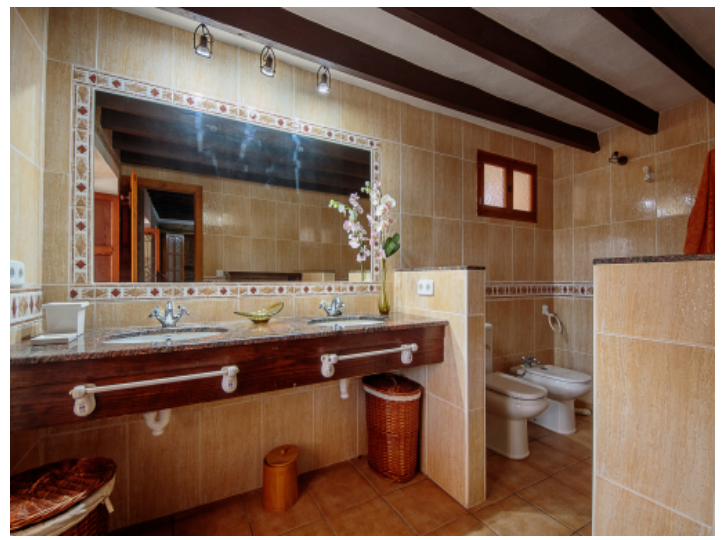
One of 2 bathroom