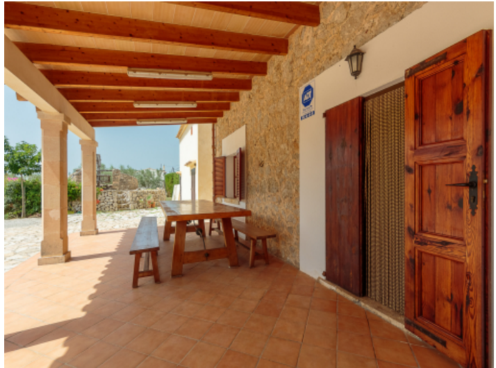
Covered dining area