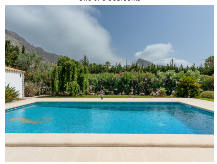
Inviting pool area