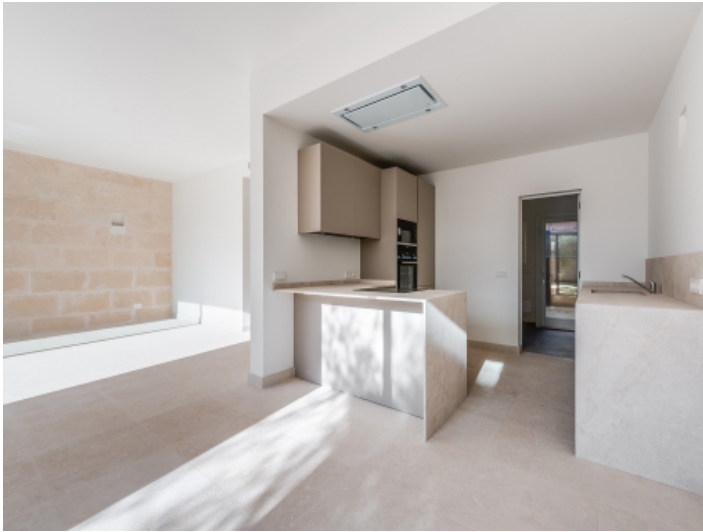
Alternative view of the kitchen