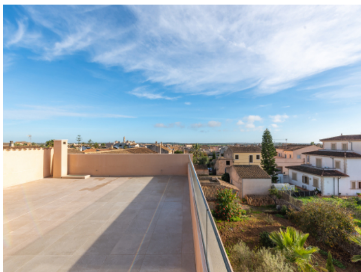
Roof terrace with a view