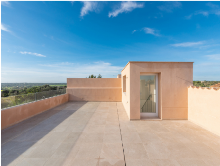
Terrace with a view