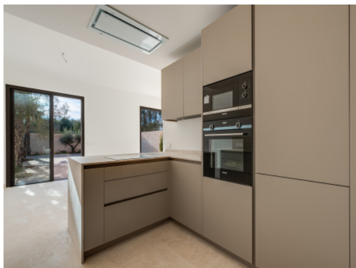
Modern kitchen with cooking island