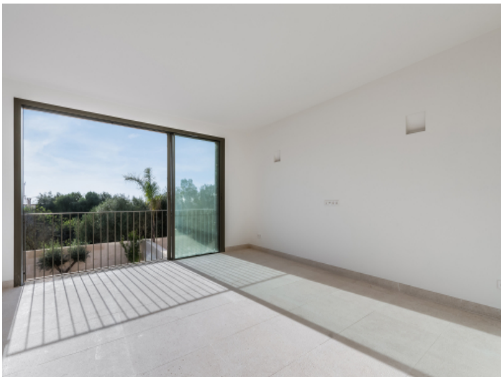
Upper living area with balcony