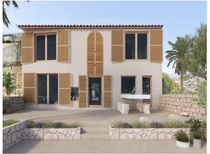
Facade view with outdoor terrace