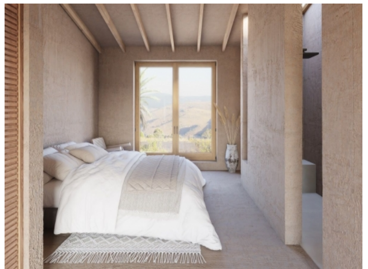
One of the double bedrooms