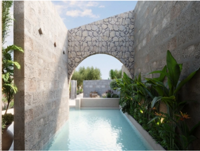
The swimming pool provides a lot of privacy