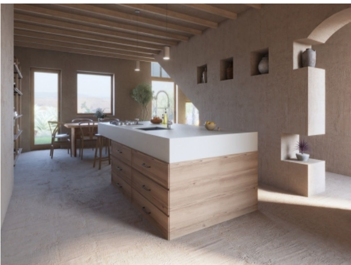
Kitchen and dining area