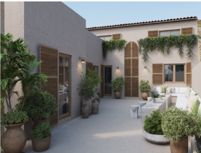
Patio with private lounge area