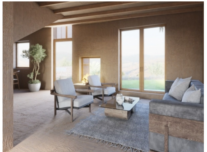
Modern interior design