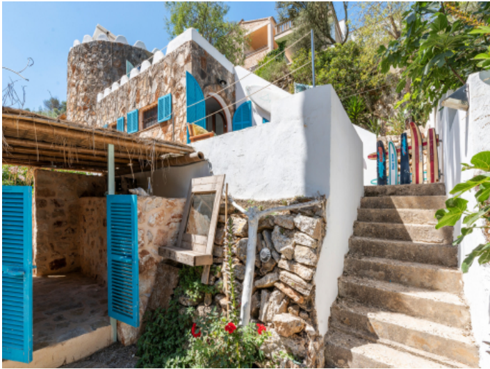
Exterior view of the chalet