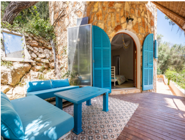
Covered terrace in the back