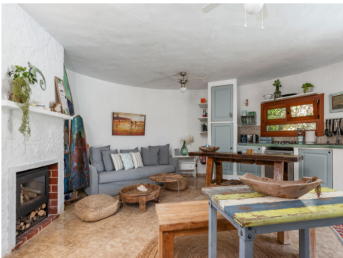
Cozy fire place