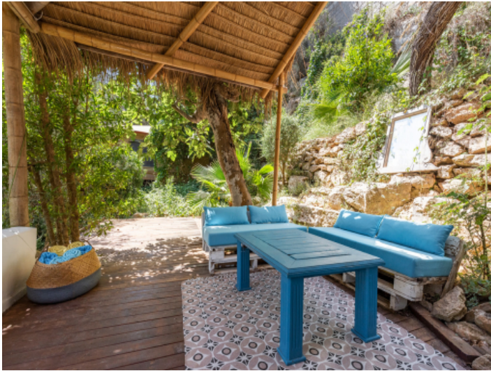
Separate sitting area