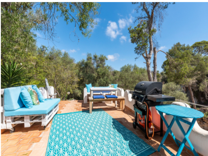
Fantastic barbecue area