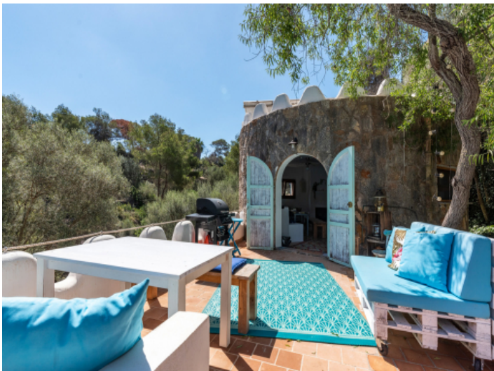
Inviting sitting area