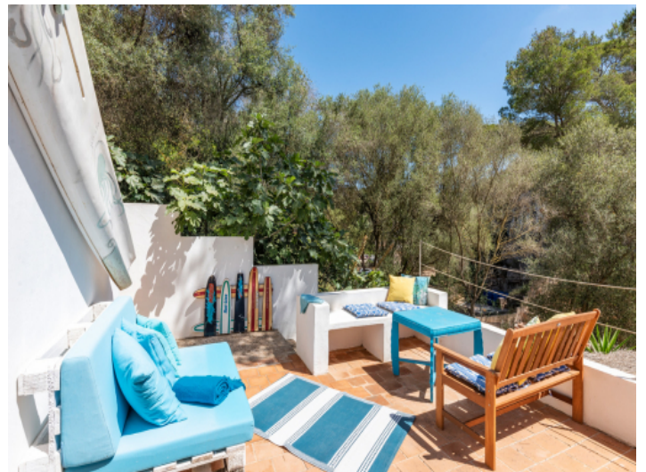
Alternative view of the terrace