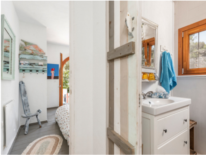
Bathroom en suite