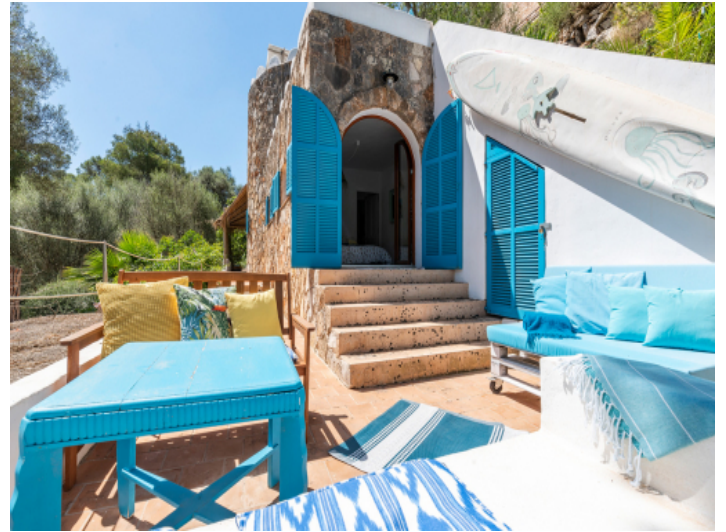
Sunny front terrace