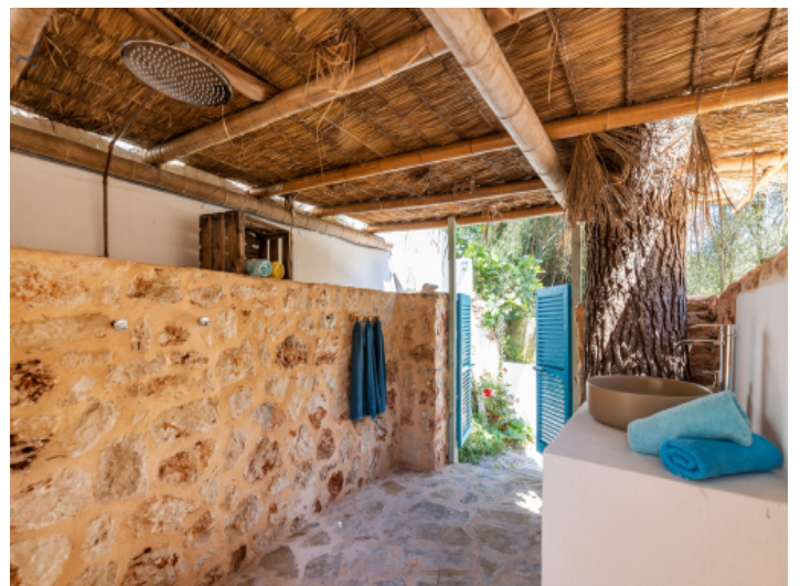
Small outdoor bathroom