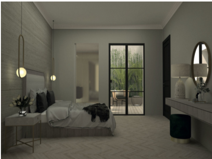
One of 3 bedrooms