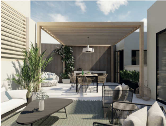
Large roof terrace