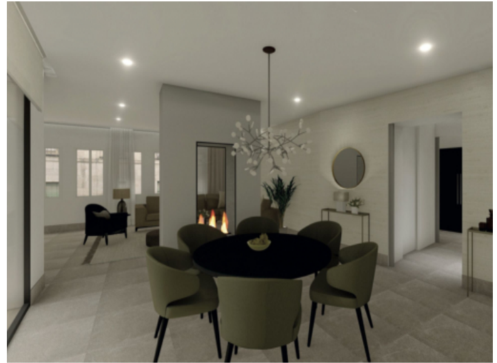
Open living and dining area