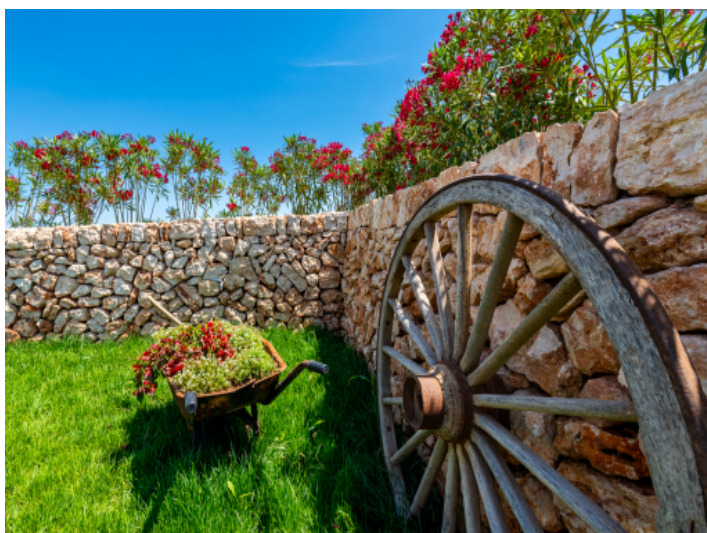
Natural stone walls