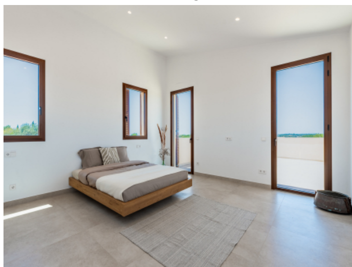
Bedroom on the first floor