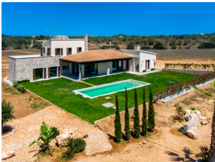
Aerial view to the property