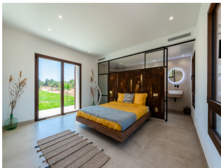
Bedroom on the ground floor