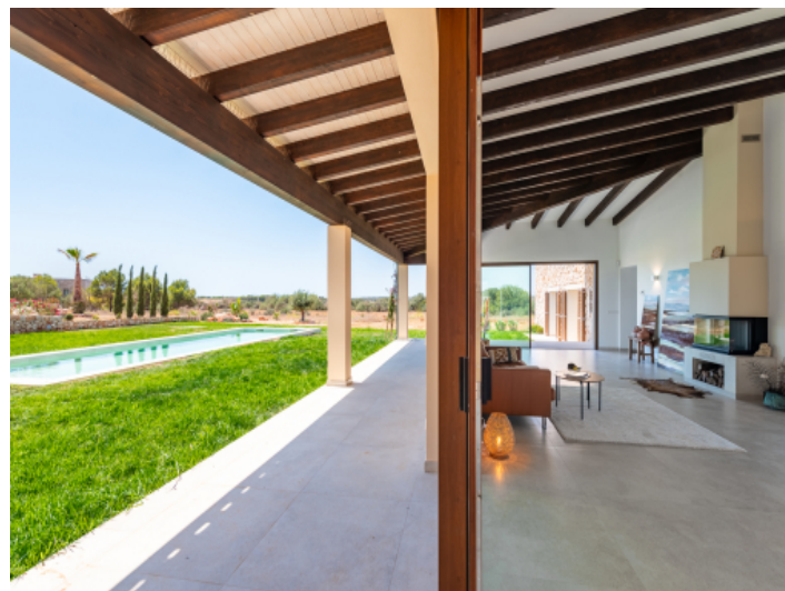
Large covered terrace