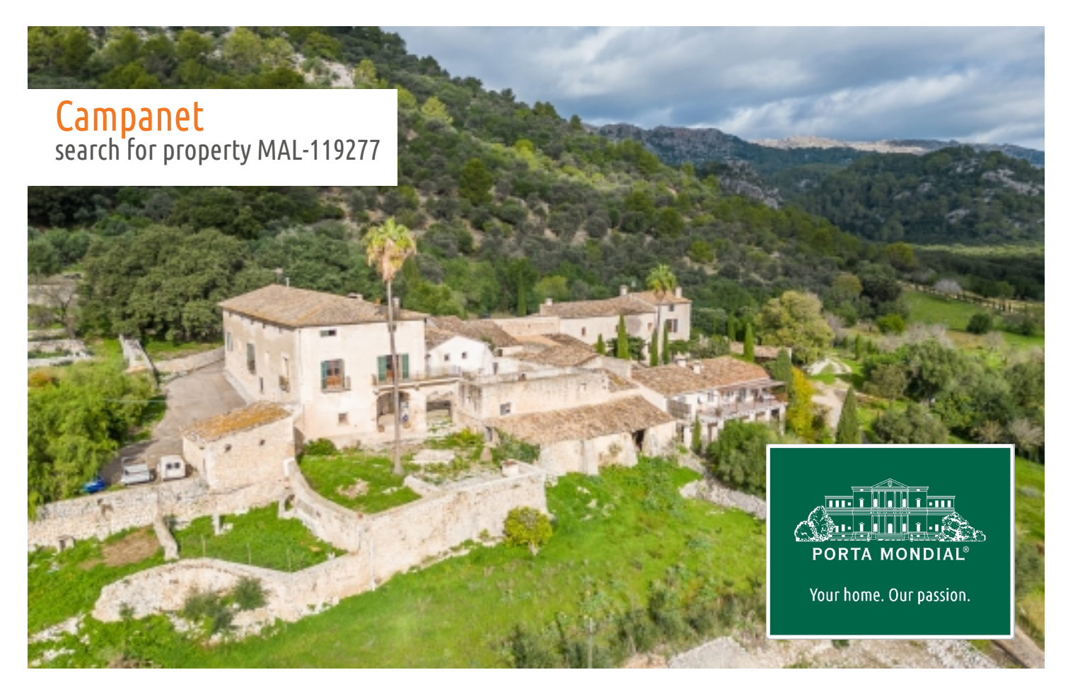
Stately finca with its own history in Campanet