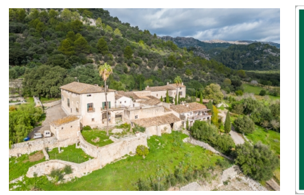
Campanet search for property MAL-119277