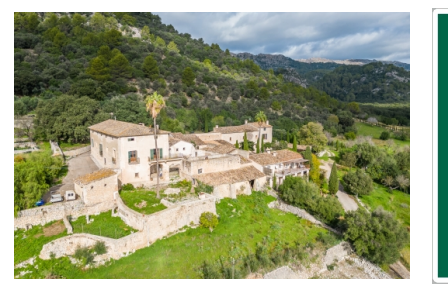
Campanet search for property MAL-119277