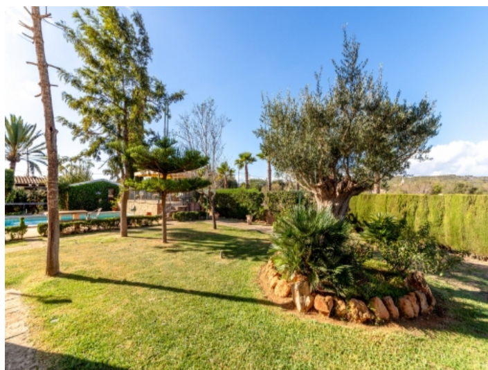
Garden next to the pool