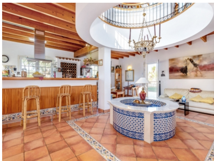
Kitchen and sitting area