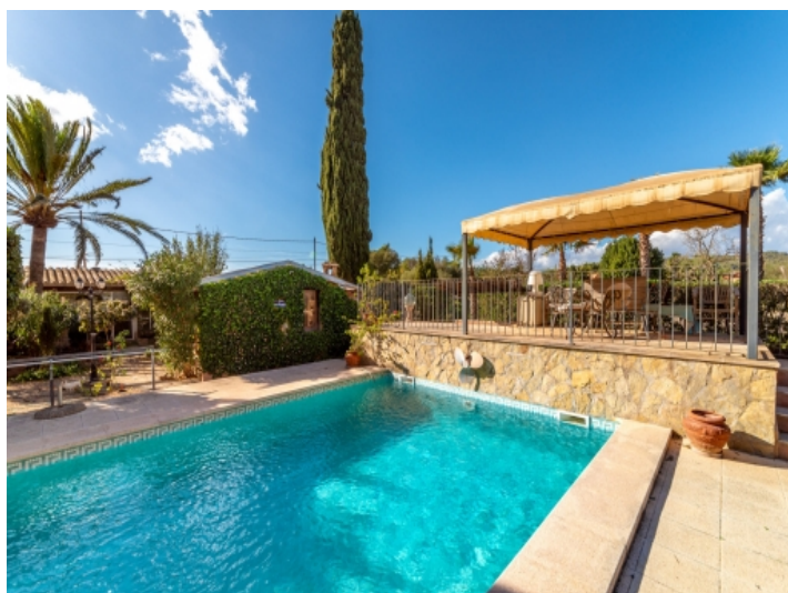
Pool area and sun terrace