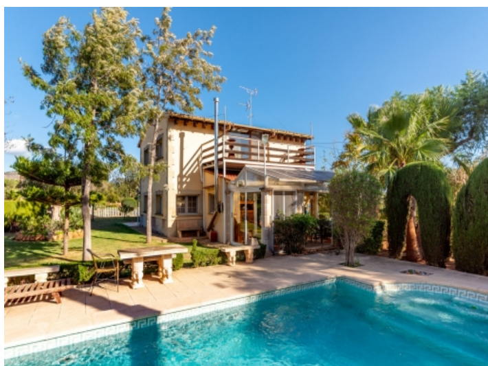
Pool area and finca