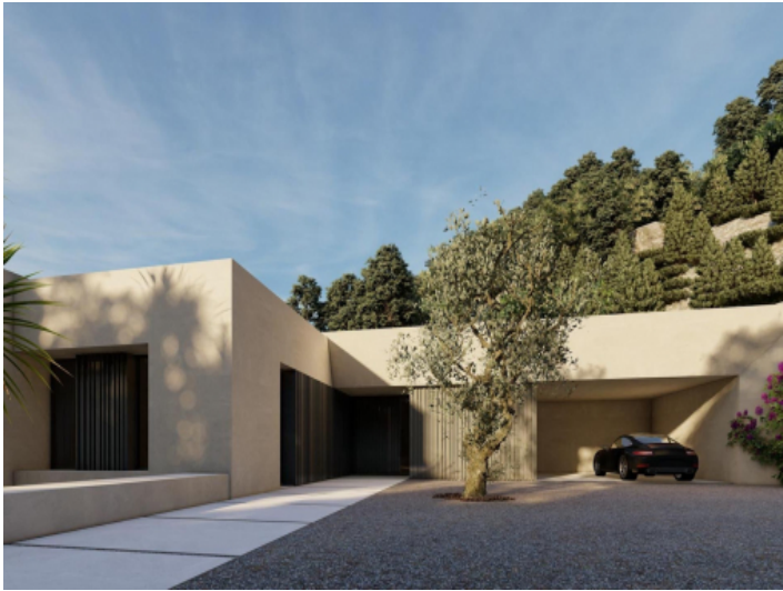
Entrance area and garage