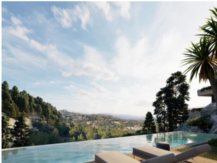
View from the pool area