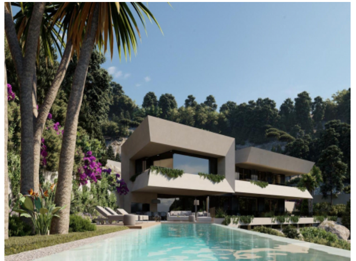
Exterior and pool area of the villa