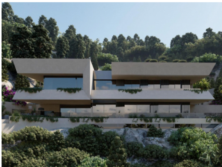
Impressive villa in the hills of Son Vida