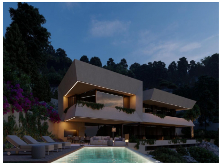
The villa by night