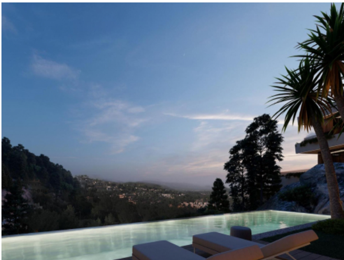
Villa with a view over Palma