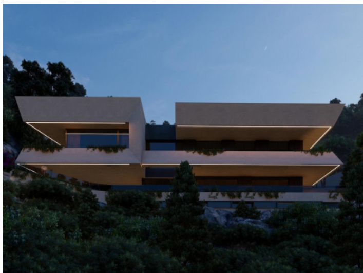
The villa by night