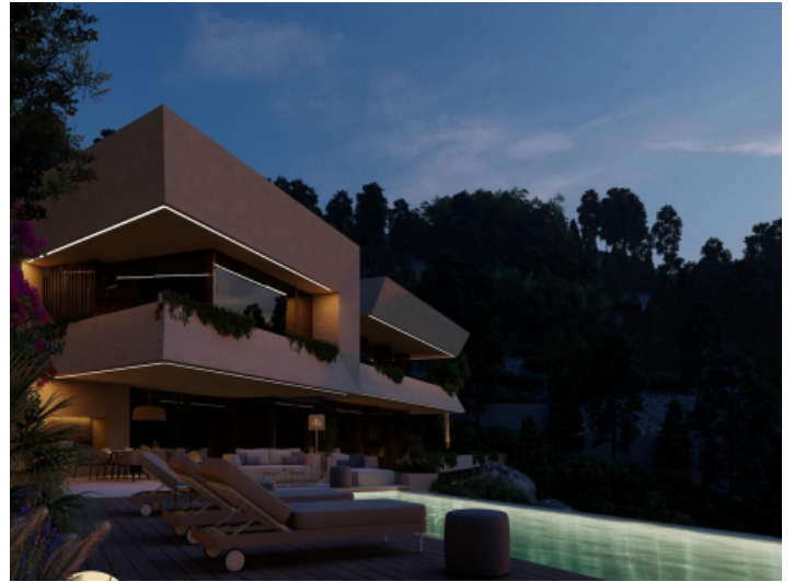
The villa and pool area by night