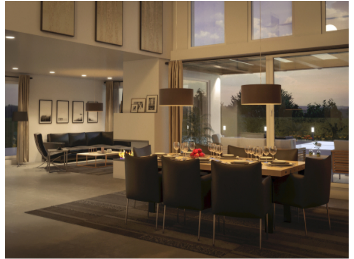
Living area by night