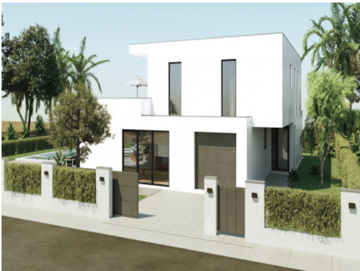
Front view of the villa