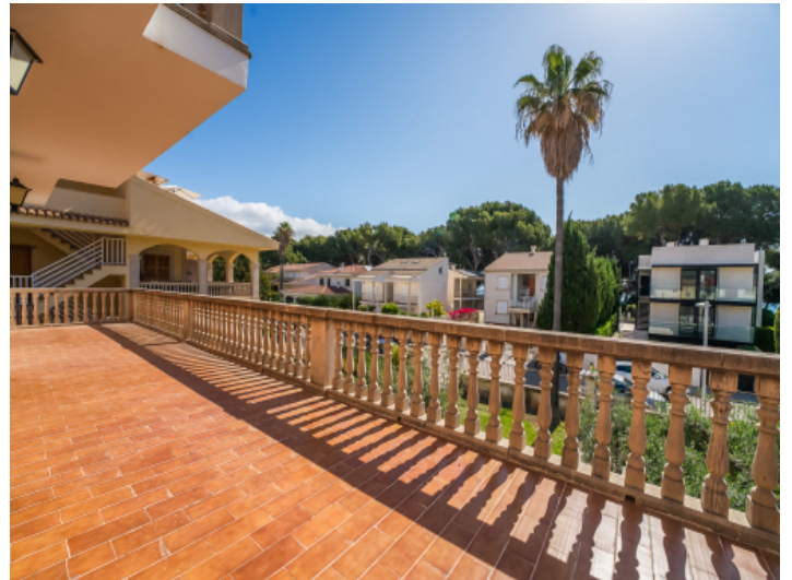
Terrace 1. floor