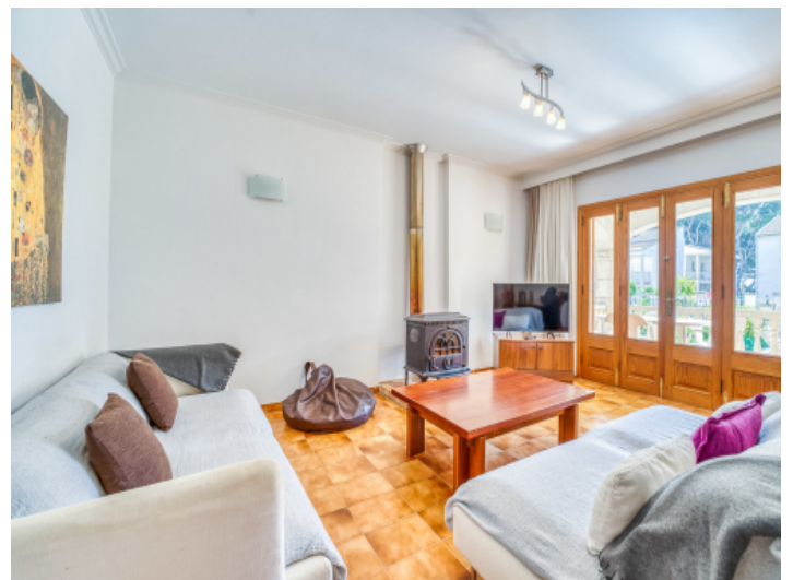
Living room with fireplace