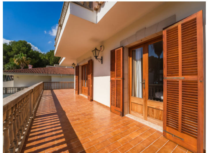
Terrace first floor