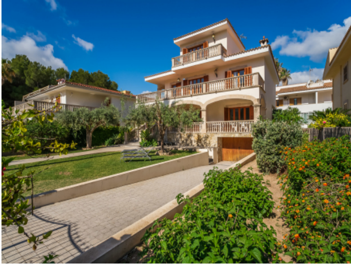
View to the house