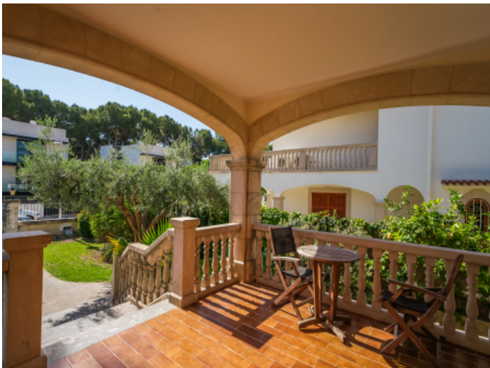
Close to the beach